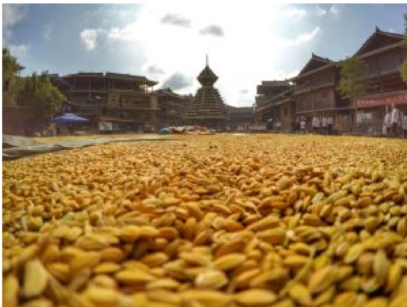
A good harvest...

For over 2500 years, the Dong have practiced and passed down their folk tradition through song. A famous Dong proverb says: “Food grows the body; singing nurtures the heart” 1 showing the indispensable value of singing in their daily life. As you make your way this August to Kaili, China, explore the centre of southern China’s unique landscape, exceptional scenery, and multi-cultural folklore.