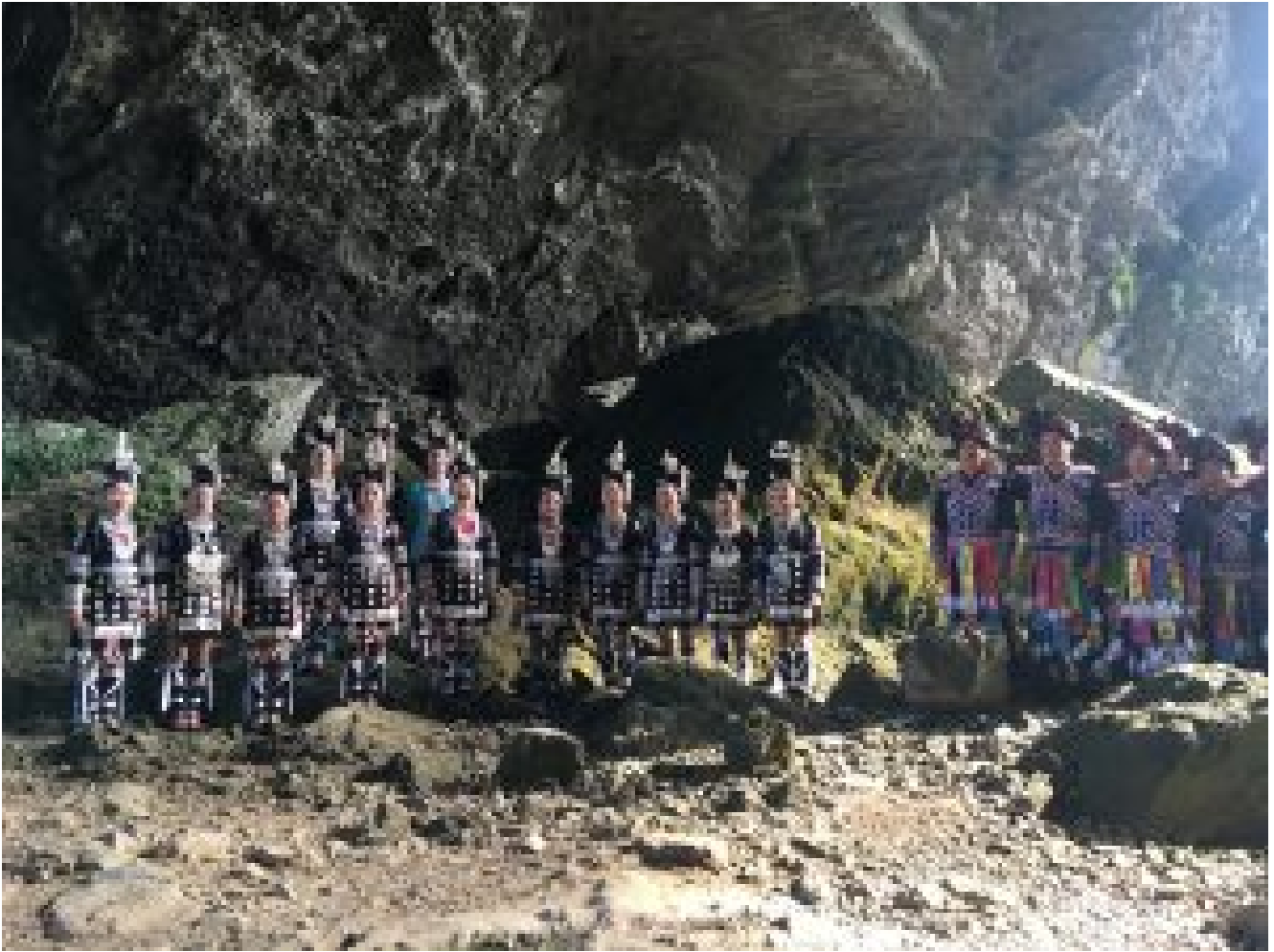
Dong Singers (picture taken in 2016)