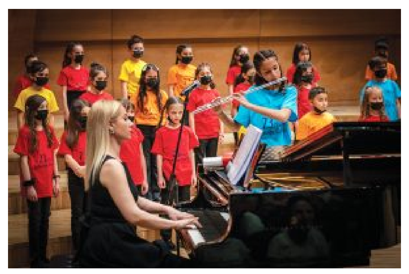
The Ministry of Culture and Tourism State Childrens' Choir