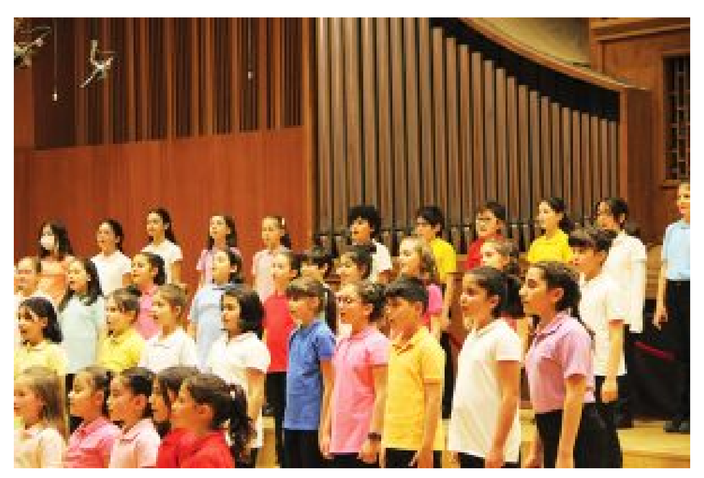
The Ministry of Culture and Tourism State Childrens' Choir

and the second in Sinop (1969). The first national choir movement of our country, which was realized with planned, diligent and devoted efforts and which raised great hopes for the future, was stopped after two years. (Değer, 2012:27)