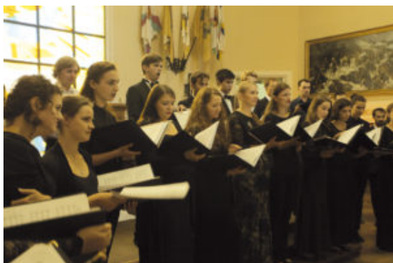
Chamber Choir Festino. Rehearsal before the final concert

The inclusion in the programme of the course of modern choral music from Western Europe is very important for the expansion of the concert repertoire of Russian youth choirs. During the master class, participants have the opportunity to discover new names and works of interest which will allow them to continue to integrate more successfully into the Western choral community.