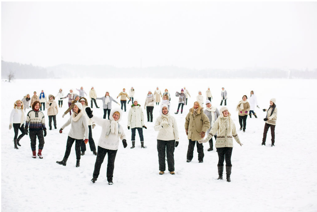
Jyväskylä Naislaulajat, Finland