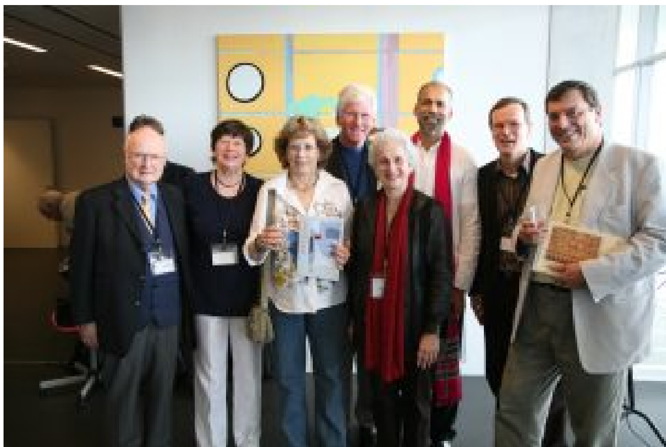
Carus Reception during the WSCM 2008, Copenhagen, Denmark. On

Carus Verlag – together with many other publishers and promoters – takes part in the music exhibition. One of the reasons for that is the cultivation of direct contact with choral directors, choral singers and representatives of choral organisations from all over the world. So it doesn't come as a surprise that this soon led to international co-operations in the area of music publishing. I would particularly like to recommend the series "Carmina Mundi", consisting of traditional choral music – original version or arranged for equal or mixed voices – from different regions of the world. As editors we find long-serving, faithful partners of the IFCM like André de Quadros, María Guinand, Alberto Grau, Maya Shavit and many more. Carus also has a close relationship with the European Choral Association, manifesting itself – amongst other ways – in the shape of the publication of European choral anthologies like "European Folk Songs", complete with CD, for equal or mixed voices, but also the superb book of "Lullabies from all the World".