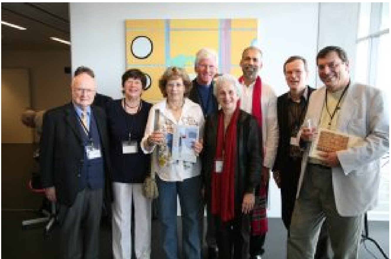
Carus Reception during the WSCM 2008, Copenhagen, Denmark. On

Carus Verlag – together with many other publishers and promoters – takes part in the music exhibition. One of the reasons for that is the cultivation of direct contact with choral directors, choral singers and representatives of choral organisations from all over the world. So it doesn't come as a surprise that this soon led to international co-operations in the area of music publishing. I would particularly like to recommend the series "Carmina Mundi", consisting of traditional choral music – original version or arranged for equal or mixed voices – from different regions of the world. As editors we find long-serving, faithful partners of the IFCM like André de Quadros, María Guinand, Alberto Grau, Maya Shavit and many more. Carus also has a close relationship with the European Choral Association, manifesting itself – amongst other ways – in the shape of the publication of European choral anthologies like "European Folk Songs", complete with CD, for equal or mixed voices, but also the superb book of "Lullabies from all the World".