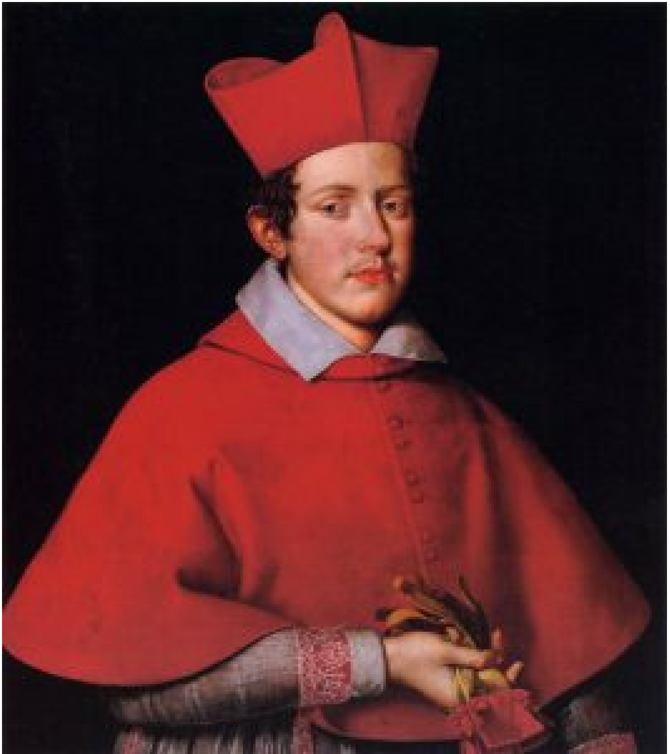
Portrait of Cardinal Fernandino Gonzaga – Pinacoteca Nazionale, Bologna

The print does indeed bear a dedication to Pope Paul V which is dated 1 September 1610. Researchers unanimously assume that Monteverdi wished to recommend himself as a composer to the Pope – and most likely to other potential church employers – with this collection. The characteristic of a “portfolio” has left an essential impression on the 1610 print in many