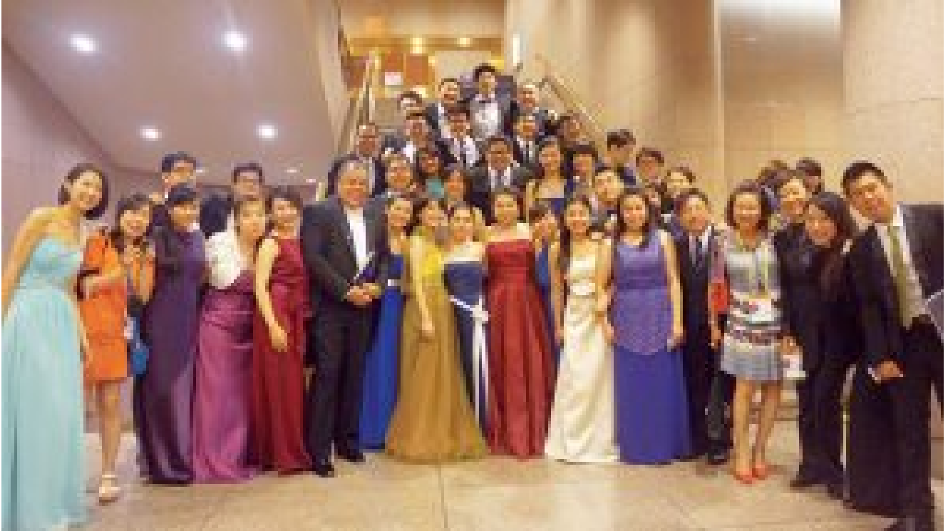
Asia Pacific Youth Choir, WSCM 2014, Seoul, Rep. Korea