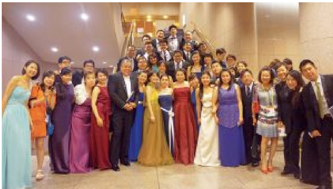
Asia Pacific Youth Choir, WSCM 2014, Seoul, Rep. Korea