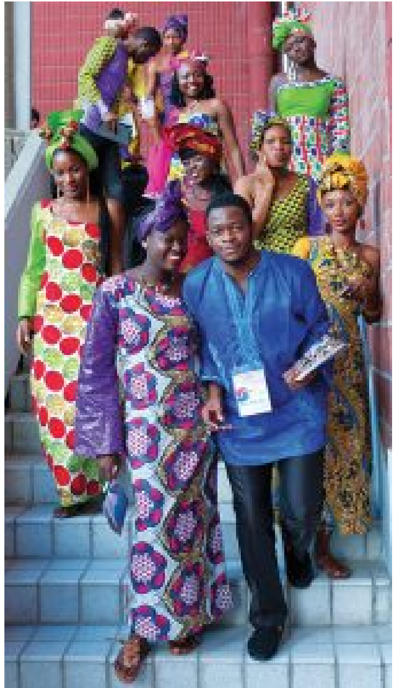
African Youth Choir, WSCM 2014, Seoul, Rep. Korea