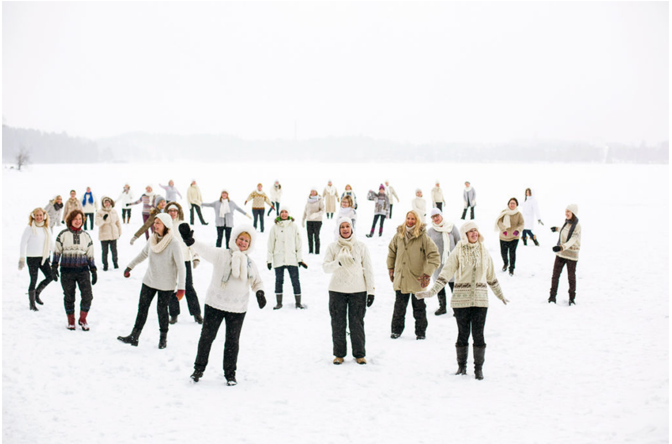
Jyväskylä Naislaulajat, Finland