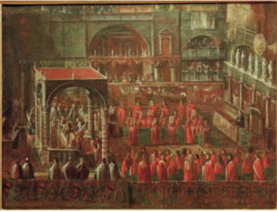
Figure 3: Alessandro Piazza, The Doge Francesco Morosini receiving the 'stocco' sword and the pileus in St Mark's Basilica, oil on canvas, c. 1700 (Correr Museum, Venice)