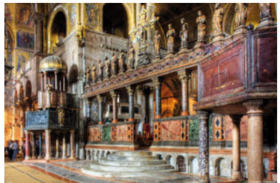
Figure 2: the entrance to the sanctuary in St Mark's Basilica; notice the screen surmounted by fourteen statues, and the two pulpits

The alterations made to the eastern end of St Mark's in the sixteenth century had a number of significant implications for the role of music in the Doge's celebrations. These alterations were carried out under the supervision of the