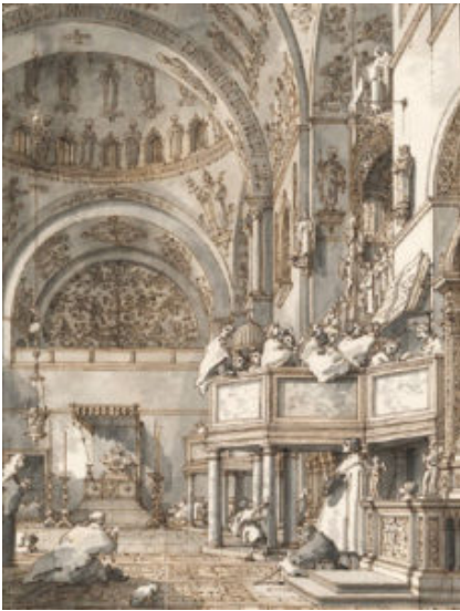
Picture 5: Giovanni Antonio Canal, Celebration of the Easter Mass in St Mark's, pen and ink drawing, 1766 (Hamburg, Kunsthalle)

The effect made by Gregorian chant in the sanctuary apse was tested by performing the psalm Domine probasti me in Willaert's setting, where a plainchant choir alternates with a polyphonic quartet (track 2 – http://bit.ly/2hNtMcn ). The plainchant singers were placed behind the high altar, while the quartet took their places in the small balcony called a pergolo ( translator's note: see figure 4 ) on the right when facing the altar (figure 1, position Bi-Bii). The vault behind the apse enabled the plainchant singers to produce mystic sound with reverberation, where the words were easy to understand. The quartet positioned in the pergolo , however, produced a much clearer, more focused sound, because their voices reverberated inside a closed space before being projected into the sanctuary. The same psalm was also performed from the two pergolo balconies (figure 1, position