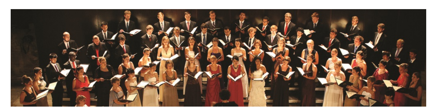
WYC concert at the ancient Odeon, Paphos

The second performance was held in the Paphos Odeon ancient open-air theatre, not far from the legendary birthplace of Aphrodite. I thought the absence of an acoustic space would somehow affect the richness of the sound we produced, but it seemed that even the starlit heavens were closer that night. The earth seemed to embrace us; an ancient energy was around us, brought forth by the surroundings built in the second century A.D.