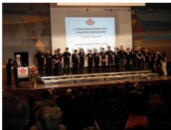
Introducing competition staff during the prize giving ceremony in the MODEON Marktoberdorf

Standards were seriously high. Each choir sounded like a winner. And it took the compulsory work, Rhapsodia , by Joseph Gabriel Rheinberger, to help audience and jury alike form more differentiated opinions. But at the end of the long day, other factors began to play a role: such as just which pieces work best in the slightly unforgiving acoustics of the MODEON.