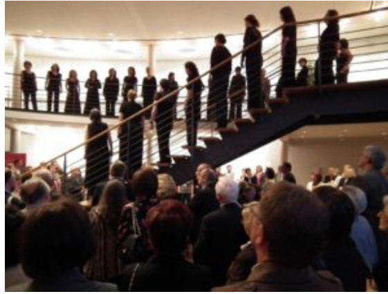
VokalArs Madrid singing for sponsors in the foyer of the Bavarian Music Academy Marktoberdorf

Standards were seriously high. Each choir sounded like a winner. And it took the compulsory work, Rhapsodia , by Joseph Gabriel Rheinberger, to help audience and jury alike form more differentiated opinions. But at the end of the long day, other factors began to play a role: such as just which pieces work best in the slightly unforgiving acoustics of the MODEON.