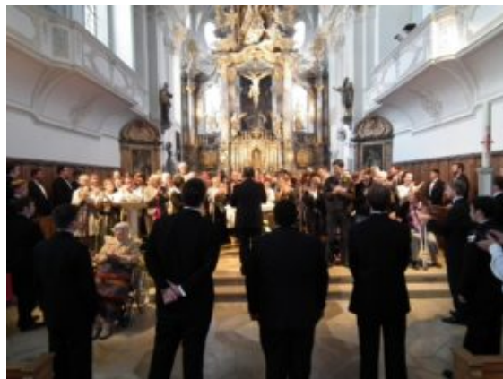
University of Louisville Cardinal Singers performing in surround sound in the Church of St. Martin Marktoberdorf

People streamed out to the foyer, dismissed sugar in their coffee. Jaded arguments spawned new camaraderie and reignited ancient disputes. Discussion focussed less on repertoire and style but more on presentation and the desire to hear within each work a story being told. Was this dressage with abandon