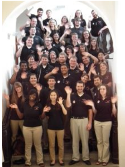
University of Louisville Cardinal Singers on a day trip to the Lautrach Castle

to boot); the Female Choir of Kiev Glier Institute of Music, Ukraine; Kamerkoor Cantate Venlo, The Netherlands; and the Female Choir of Estonian Choral Conductors, Tallinn, Estonia.