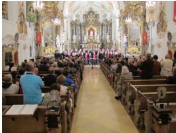
A joint performance by S:t Jacobs Ungdomskör and Cantabile Regensburg in the Church of St. Ulrich Seeg