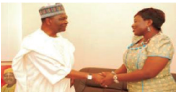
Ify Ebosie with former Head of State, Yakubu Gowon

These activities serve to provide reliable data on the unique cultural and creative activities and the capacities of the communities for socio-cultural capital re-engineering, and consequently promote development of policies that will gradually transform creative activities feedback into formal, creative, and cultural economy. The aim is also to strengthen diversity, and to assess the capacity of religious activities to meet the prerequisite of social solidarity and national integration, by using activities such as courtesy call visits and focus group sessions during the AFNC preliminary festivals in the local communities.