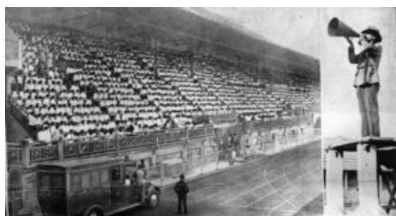
Villa-Lobos directing the Orpheonic choirs at São Januário Stadium