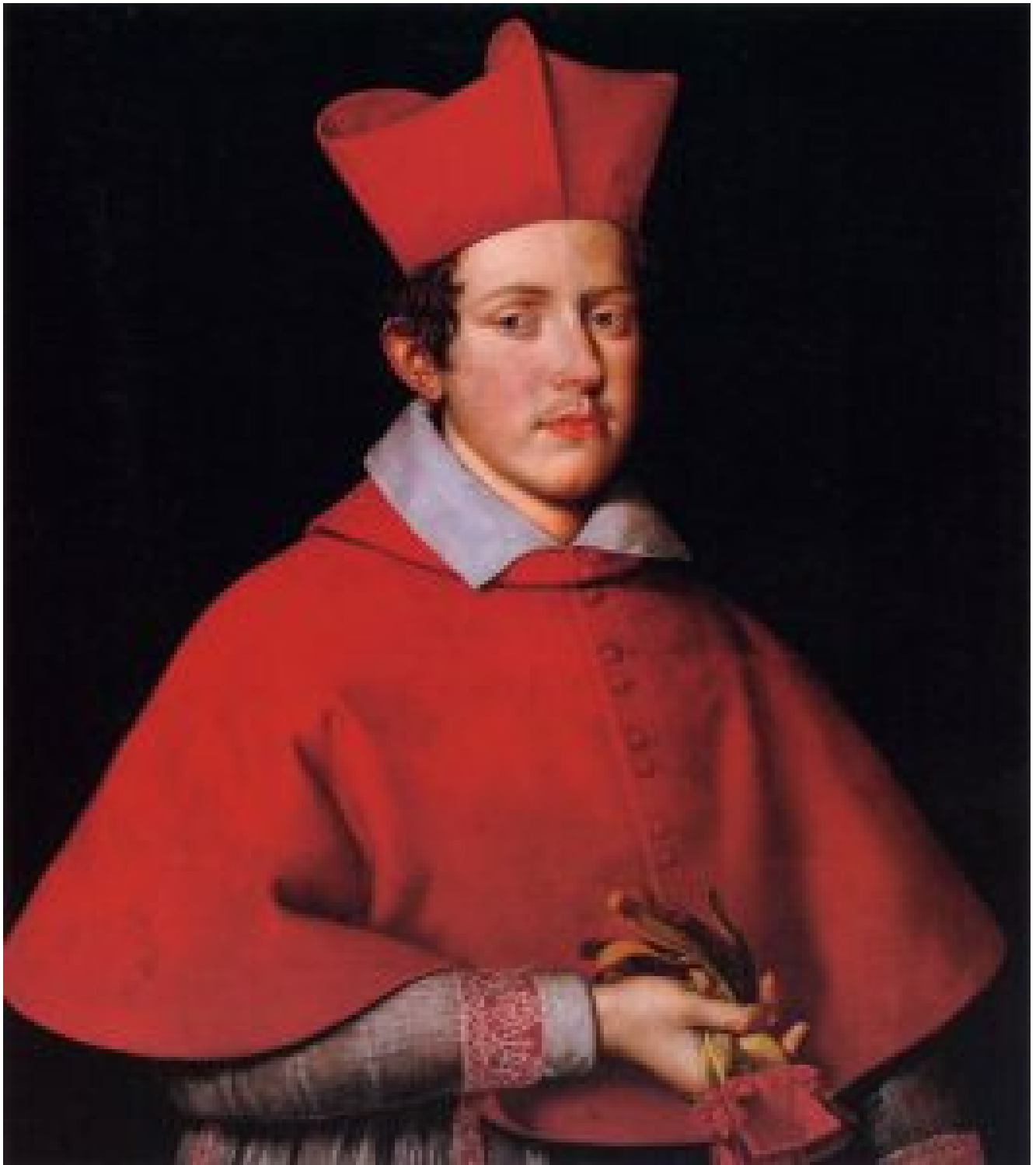
Portrait of Cardinal Fernandino Gonzaga – Pinacoteca Nazionale, Bologna

The print does indeed bear a dedication to Pope Paul V which is dated 1 September 1610. Researchers unanimously assume that Monteverdi wished to recommend himself as a composer to the Pope – and most likely to other potential church employers – with this collection. The characteristic of a “portfolio” has left an essential impression on the 1610 print in many