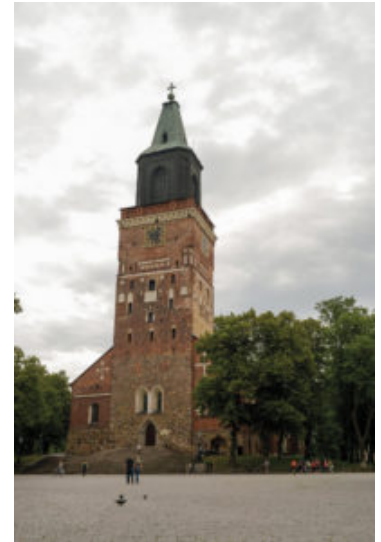
The old Cathedral downtown Turku