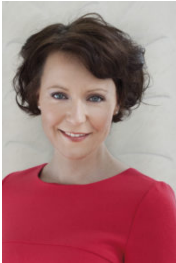
Mrs. Jenni Haukio, President's wife, Patron of the festival

We are very proud to announce that Mrs Jenni Haukio, the spouse of the President of the Republic of Finland, will be the patron of the festival.