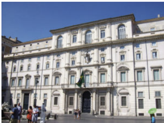
Palazzo Doria-Pamphilj (Illustration 4)

Nor was it under the roof of a church that the Messiah did eventually get staged in Rome for the first time, but within the framework of a select musical society, the so-called Società musicale romana . This society was an academic musical association particularly keen on supporting “early music”. In