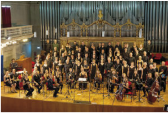
The 'Choir Academy' in the 'Sala Accademica del Conservatorio di Santa Cecilia' (Illustration 8)

The first performance of the Messiah in 1742, the local première in Rome of 1876 and ours of 2015 by the International Choir Academy (Illustration 8) are separated from each other by more than 130 years respectively. In the intervening periods, the classical music business and Handel reception have undergone several renewals. Handel's time and also that of the castrati is long over; but although towards the end of the 19th century a consciousness of historical performance practice started to emerge, becoming increasingly acute and often objecting successfully against monumentalism, the custom of massed concerts with huge Hallelujah -choruses has survived to our day. Handel's composition, however, permits very different manners of reception: as even when Handel himself was in charge, the work absorbs ever-new contextualisations and today, in numerous arrangements, moves effortlessly from performance practice strongly influenced by academic insight to Hallelujah flash mobs in shopping centres.