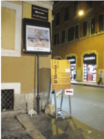
Poster of the Concert in Rome (Illustration 10)

The International Choir Academy 2015 was run in close co-operation with the Italian cultural organisation BISSE in Spoleto. This would have been impossible without financial support by the Goethe-Institute [an official German institution with branches all over the world, working to spread knowledge and understanding of German culture and the German language – translator] as well as the Foreign Office of the Federal Republic of Germany. Two orchestras were available: the Junges Philharmonisches Orchester Niedersachsen and the chamber ensemble of the Accademia Santa Cecilia di Roma .