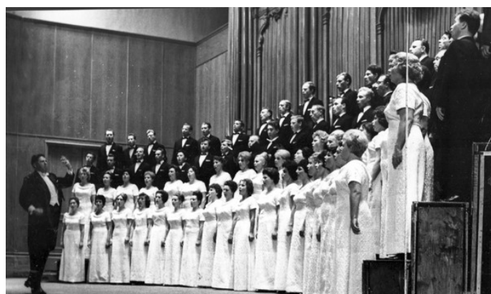
Capella Choir concert under the baton of Alexander Yurlov

Russian Choir, at one time considered a direct competitor of the State Choir, despite the fact that it was subordinate to republican authorities, and not to the Union.