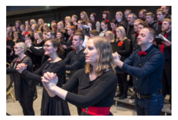
Sign Language Choir & Choir of Flensburg & Vocal Project