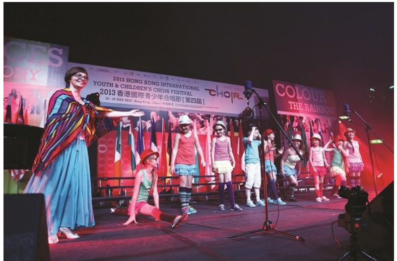
Rassvet (Russia) receives a warm applause for their energetic performance