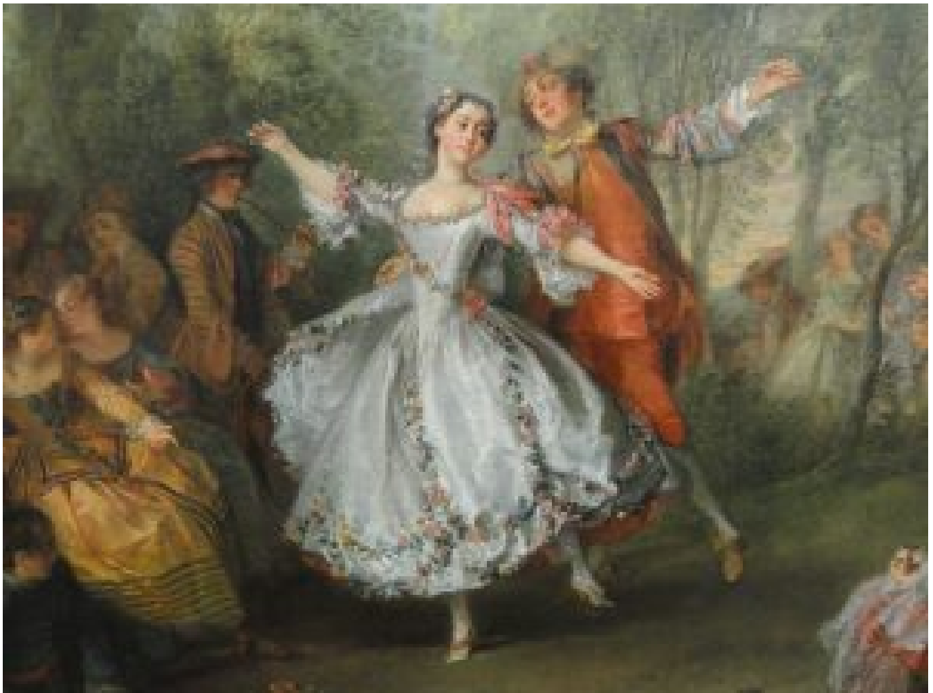
La Camargo Dancing by Nicolas Lancret, c. 1730, oil on canvas – National Gallery of

Another good example of ambiguity, very frequent in English songs, can be found in Of all the Birds by John Bartlet. In this song, a sparrow is described with human features and without really letting you know whether it is a man or a woman. Phillip, initially a male name, is rather contradictory, as there are then several references using the pronoun “she”. The lyrics describe all the virtues that Phillip has, with so many references to lips and tongues that chant, chirp and make such cheer that it makes it hard to believe that this song is the serious description of a particularly talented bird.