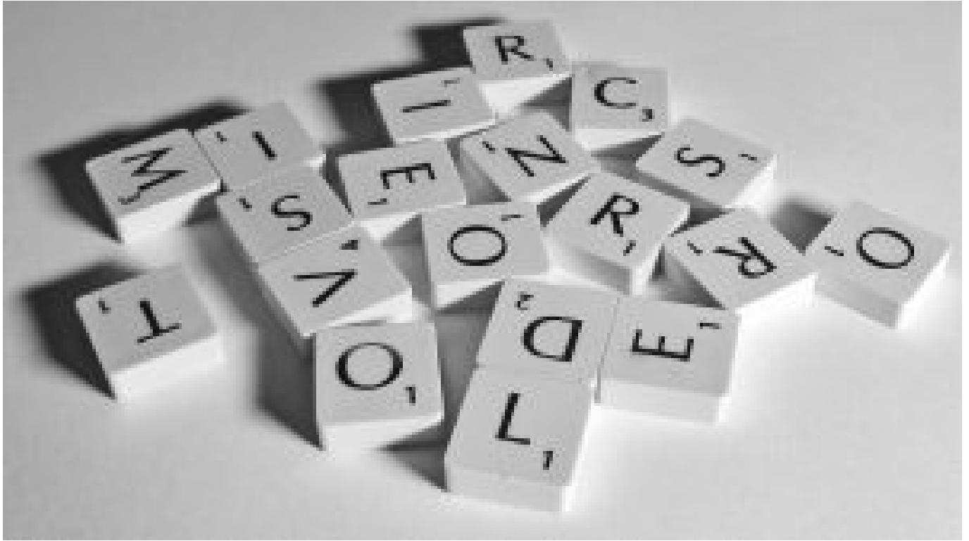
Placing 'Scrabble' tiles

rather an extract that we would like to share with you about how we have enjoyed playing with words and music that is more than four hundred years old. Furthermore, these ideas could certainly be applied to any choral music.