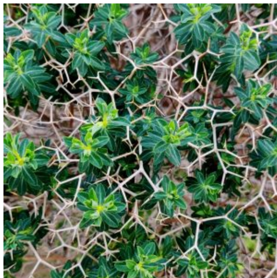
Dissuasion © Eve Lomé

offer the vegetarian option as the norm and meat only per request on the registration form? Could we pay more attention to using regional products only? Is there a way to pass on food that wasn't needed? Can we set up water fountains on site and ask people to refill their reusable bottles there?