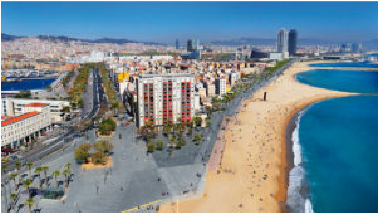
La playa de la Barceloneta