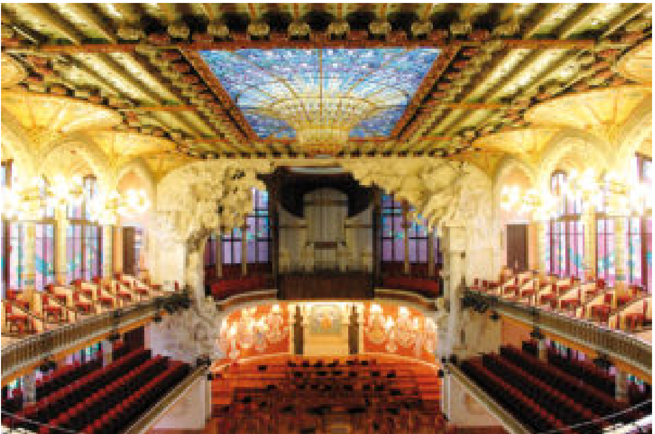
Palau de la Música Catalana, Barcelona

Its official name is: Expiatory Temple of the Sacred Family. Gaudí's famous church is one of the distinguishing features of the city and one of the most popular buildings in the world. A World Heritage Site, building began in 1883 and still hasn't finished. Its eight imposing built towers, out of the 18 that Gaudí designed, and the impressive facades of the Glory, the Birth and the Passion, invite you to visit its interior from which you can climb some of the towers in order to contemplate a stunning view of the city.