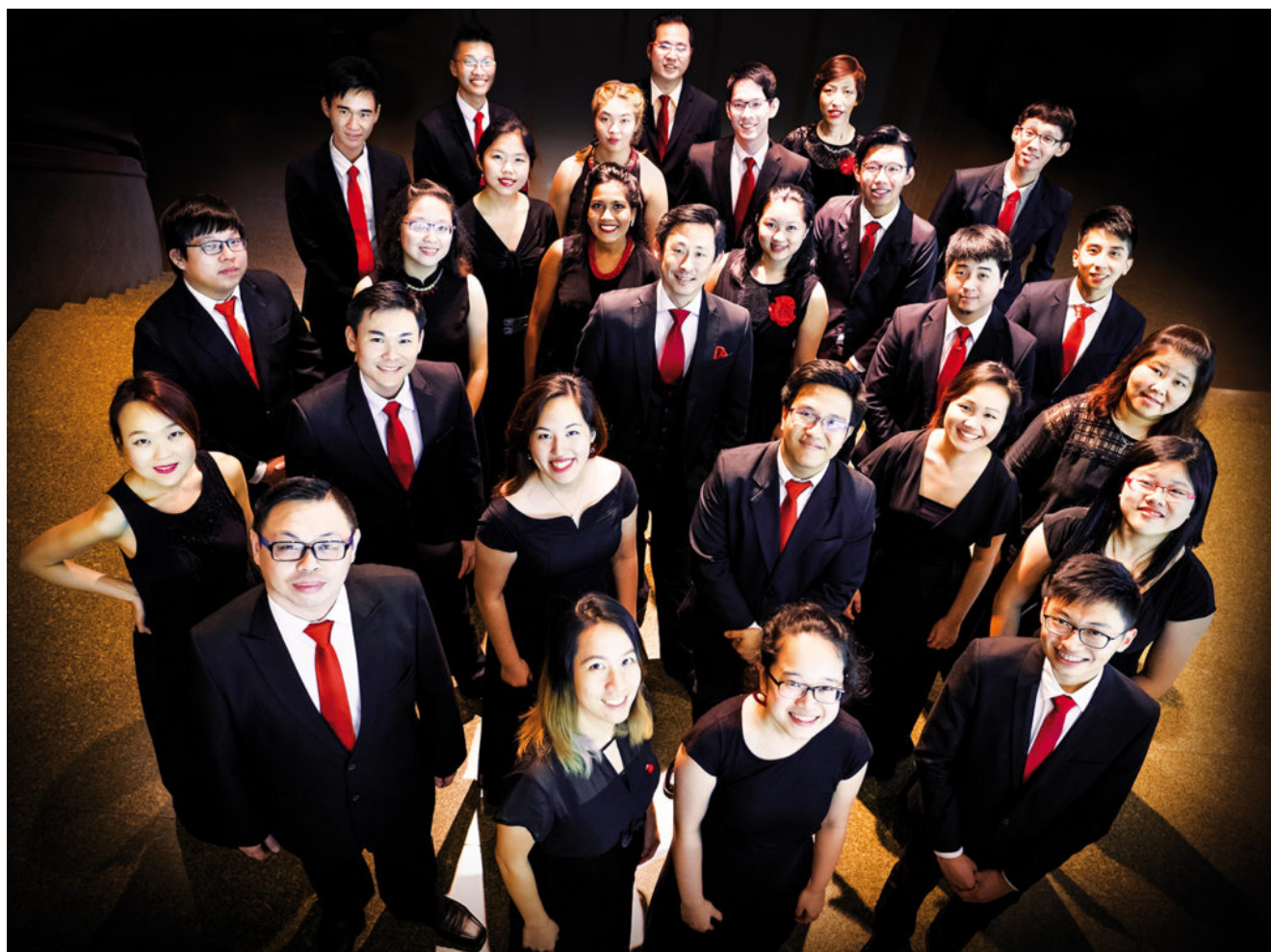
Raffles Singers, Singapore

in its construction. Declared a UNESCO World Heritage Site 20 years ago, the building is a homage to music and the proud historical traditions of Catalan music in particular. This splendid venue will host two of the official symposium concerts.