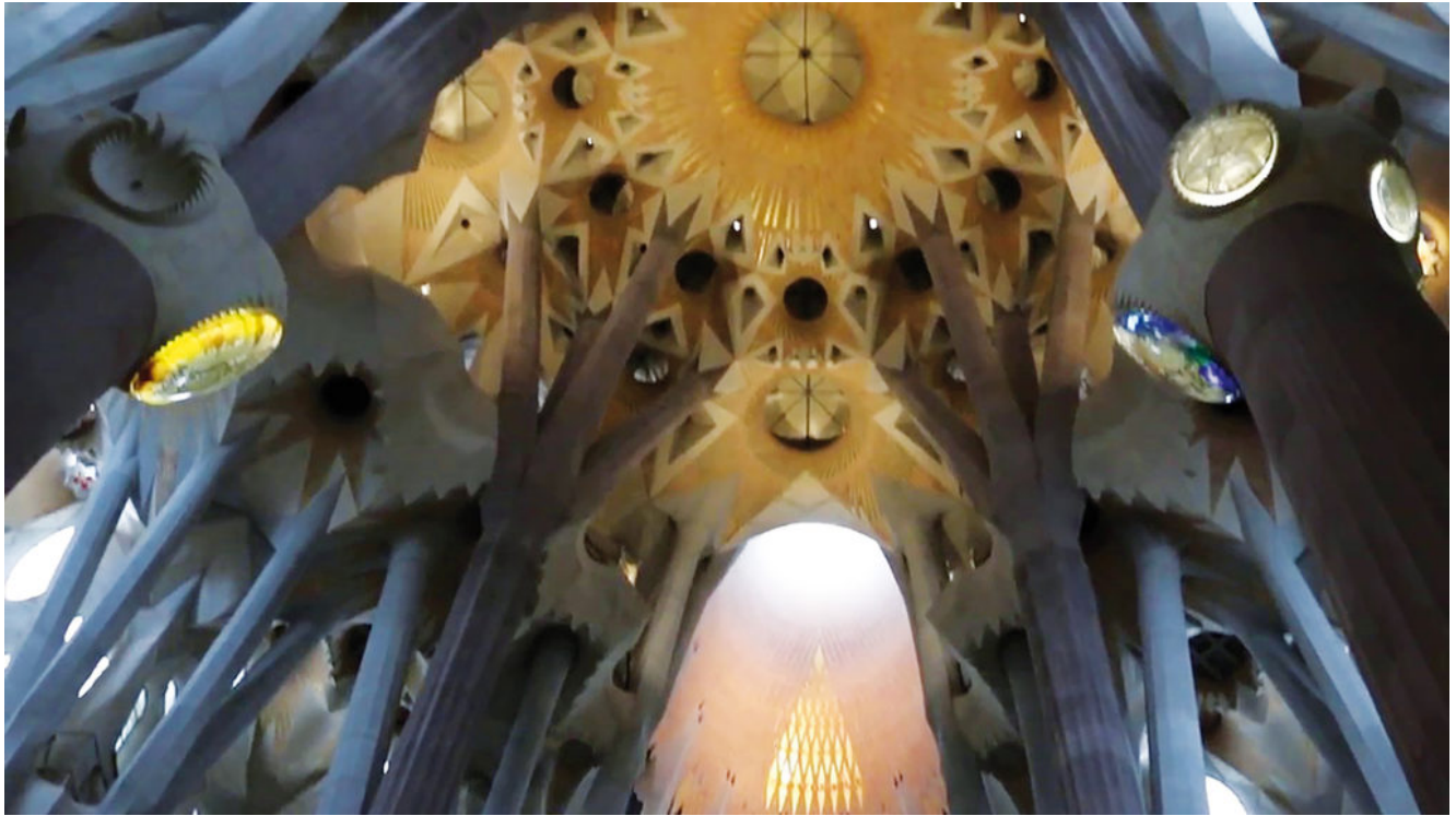
The magnificent interior of the Sagrada Familia

dynamic cultural hubs; and in the Auditori del Conservatori del Liceu , located in the Raval district right by the historic city centre, where there is a new building housing the Conservatorio Superior de Música del Liceu. This auditorium is located on a prestigious thoroughfare linking the Rambla with the Avenida del Parallel, famous for its theatres.