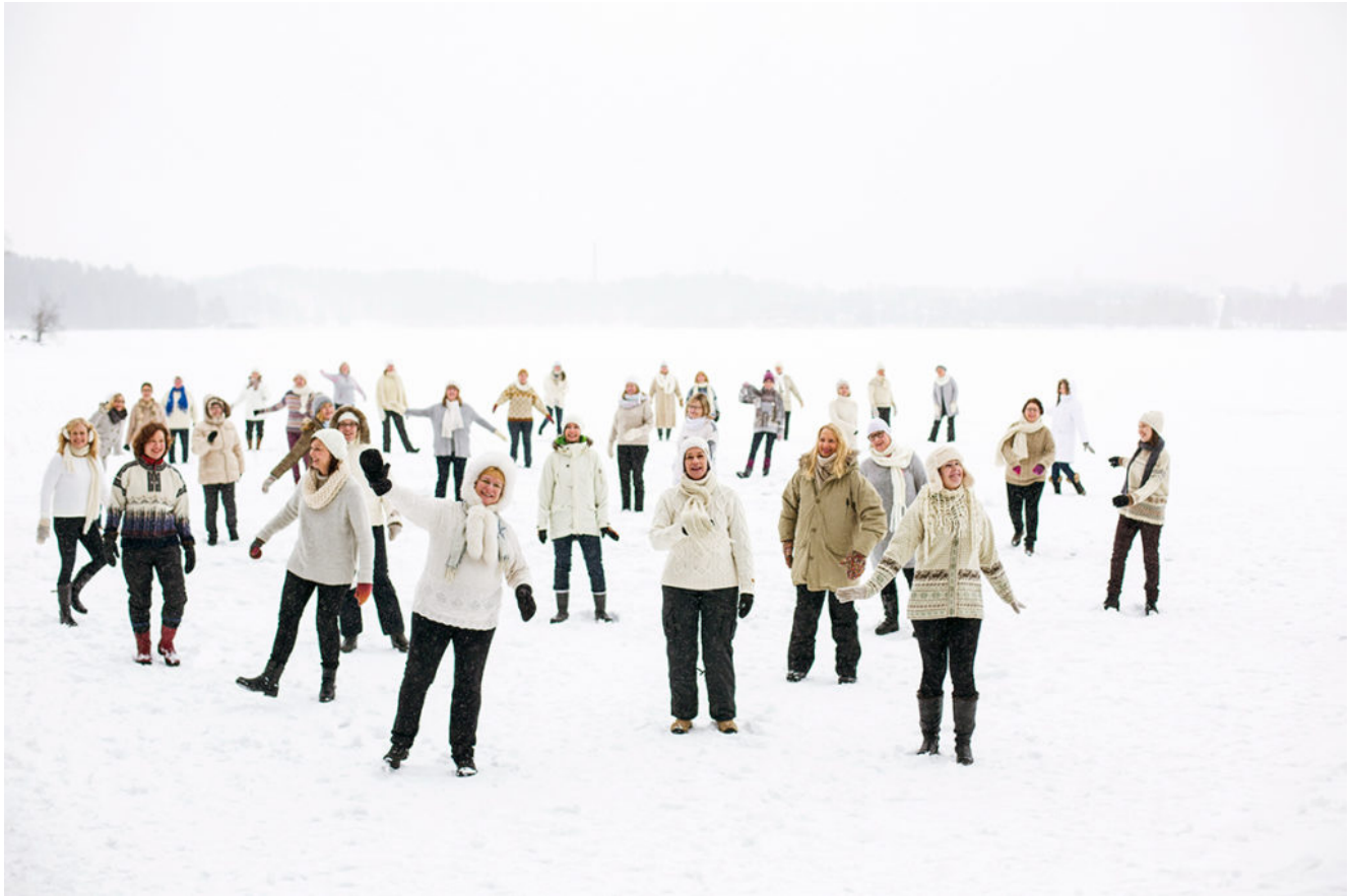
Jyväskylän Naislaulajat, Finland