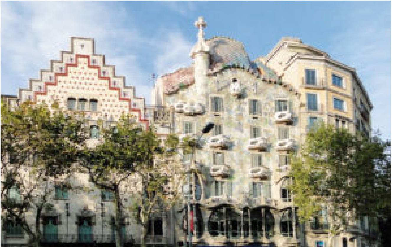
Passeig de Gràcia: Casa Amatller and Casa Batlló

The Passeig de Gràcia is one of Barcelona's best shopping streets. The ground floors of the impressive modernist buildings house restaurants, cafés, jewellery shops and such well-known fashion labels as Louis Vuitton, Loewe, Armani, Cartier, Gucci or Yves Saint Laurent.