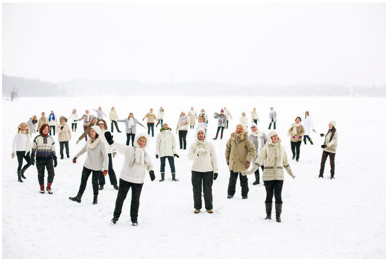
Jyväskylän Naislaulajat, Finland