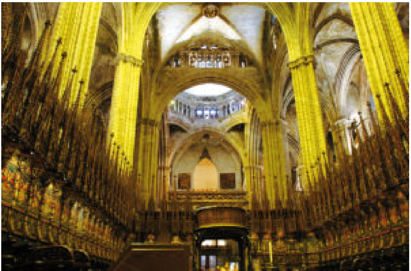
Inside the Barcelona Cathedral