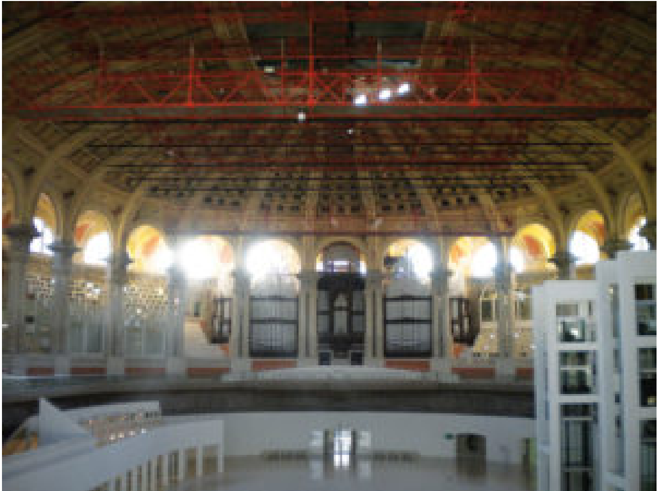
Inside the National Museum of Catalan Art

A small mountain that flanks Barcelona to the south, where you will find various attractions: