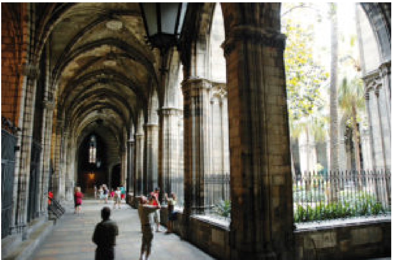
Barcelona Cathedral Cloister

Further out from Barcelona, it's also possible (and easy) to visit the Costa Brava which gets its name, "wild coast" from the uniqueness of the abrupt encounter between mountains and sea. Nature, climate, history and certain picturesque ports and villages have been enough to give it a world-wide reputation. Similarly, the Costa Dorada , south of Barcelona, is another excellent option. Its golden, luminous shores are the reason for its name (Golden Coast).