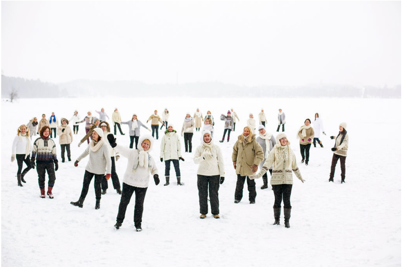
Jyväskylä Naislaulajat, Finland