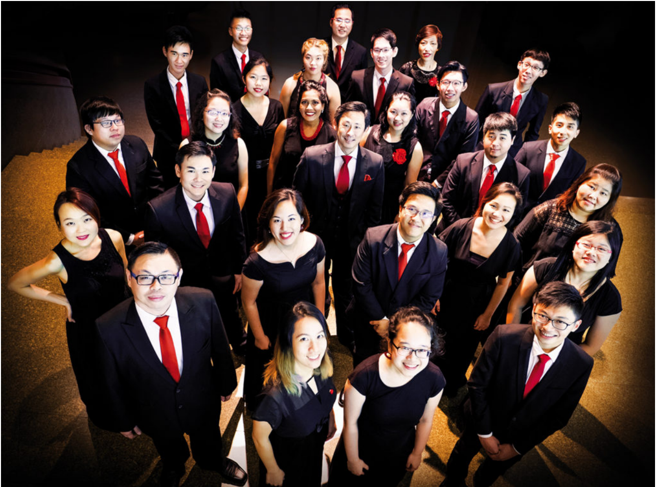
Raffles Singers, Singapore

in its construction. Declared a UNESCO World Heritage Site 20 years ago, the building is a homage to music and the proud historical traditions of Catalan music in particular. This splendid venue will host two of the official symposium concerts.