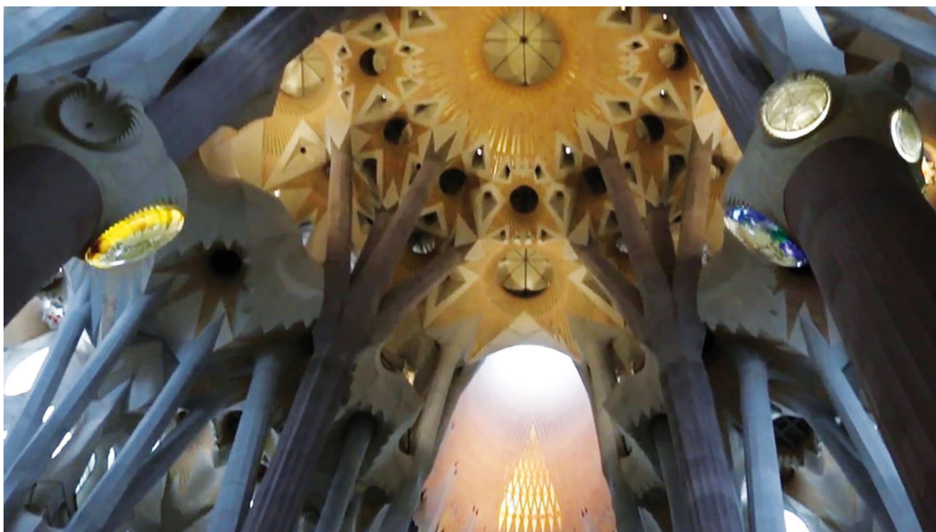
The magnificent interior of the Sagrada Familia

dynamic cultural hubs; and in the Auditori del Conservatori del Liceu , located in the Raval district right by the historic city centre, where there is a new building housing the Conservatorio Superior de Música del Liceu. This auditorium is located on a prestigious thoroughfare linking the Rambla with the Avenida del Parallel, famous for its theatres.