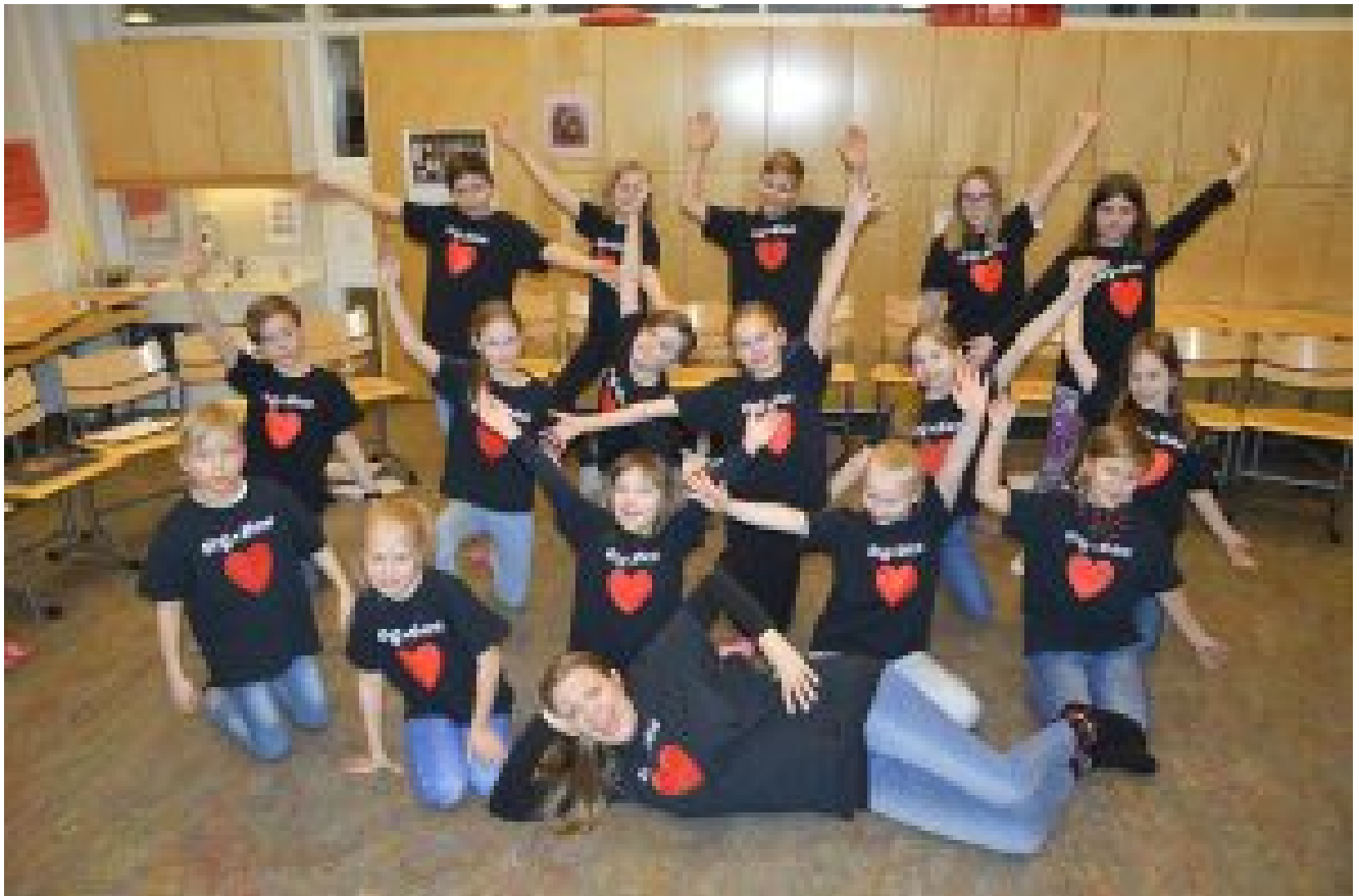
Rehearsals, March 2019, Westendinpuijon school, Espoo, Finland