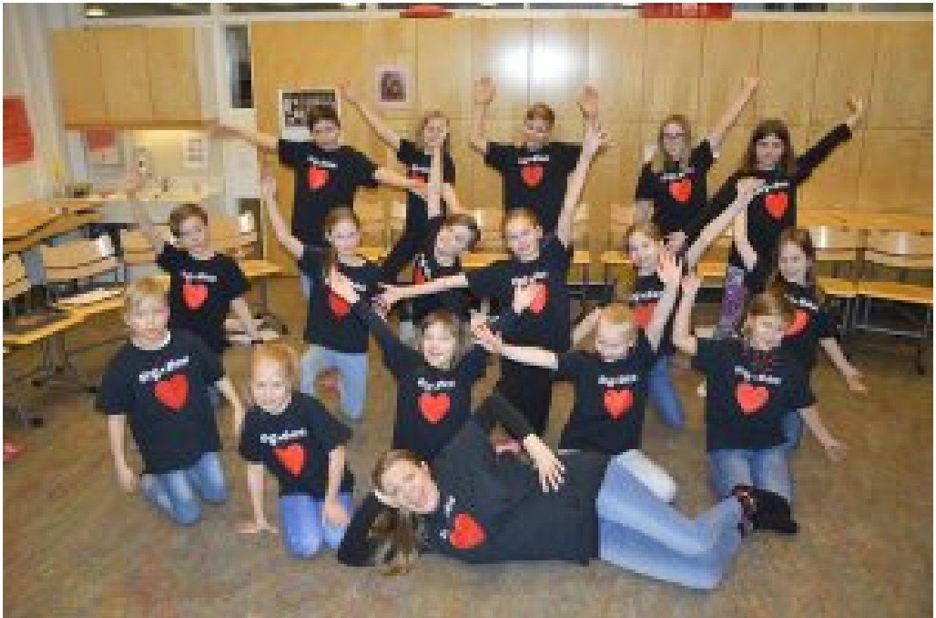
Rehearsals, March 2019, Westendinpuijon school, Espoo, Finland