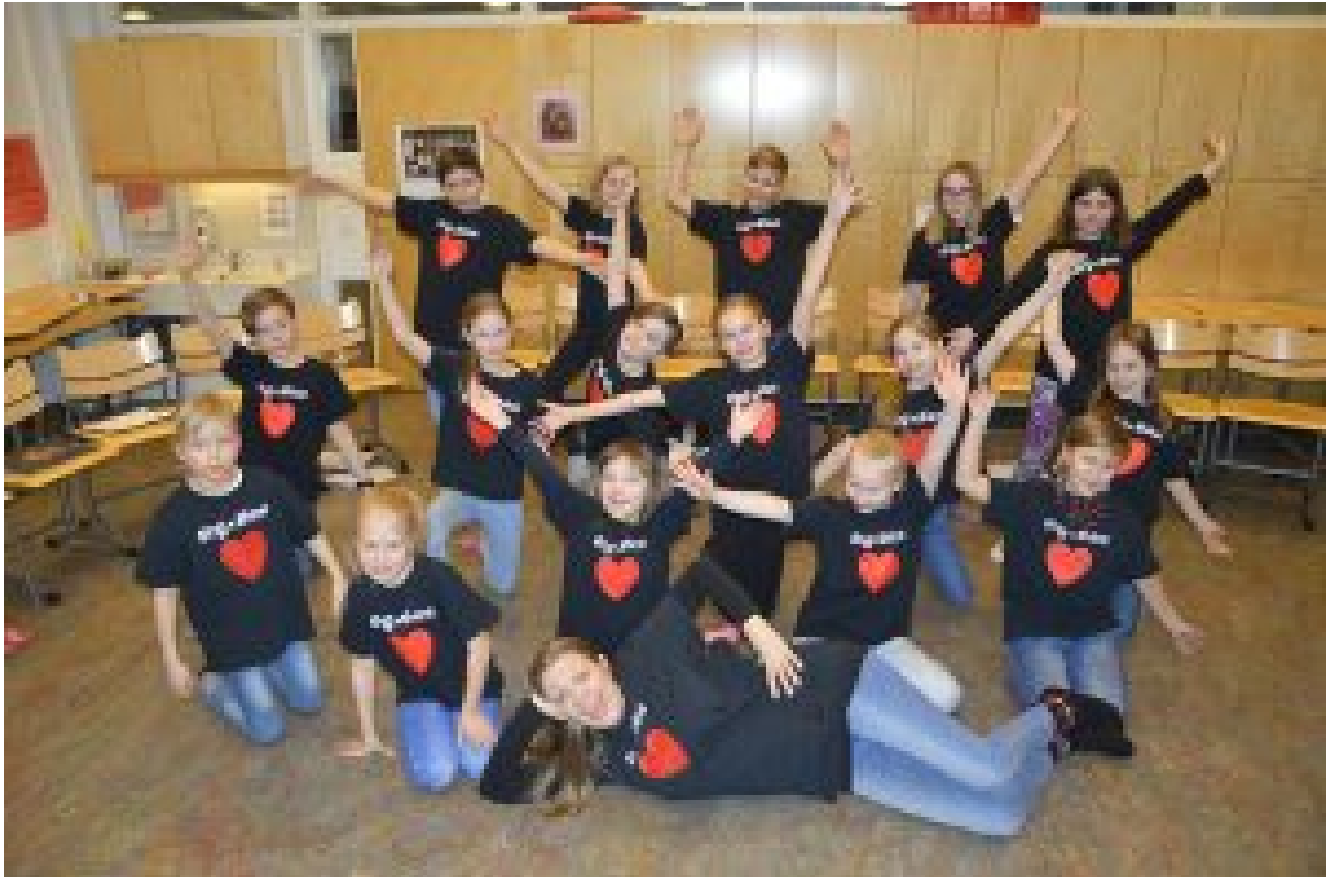
Rehearsals, March 2019, Westendinpuison school, Espoo, Finland