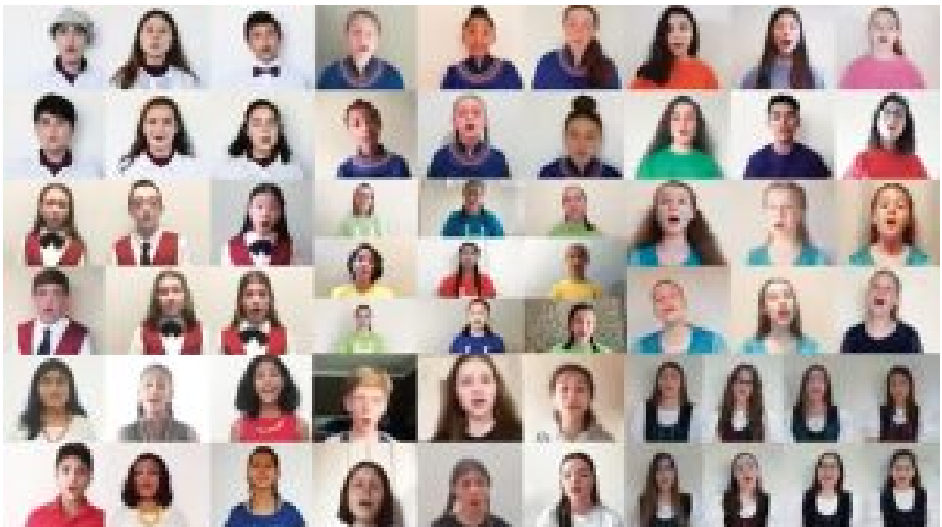
Young Voices of the World participants: 1st and 2nd rows (from left to right) Kodaly Conservatory Children's Choir of Greece, Tygerberg Children's Choir, Leioa Kantika Korala Children's Choir; 3rd and 4th rows (from left to right) Shenandoah Valley Children's Choir, Hamilton Children's Choir, Ponomaryov Vesna