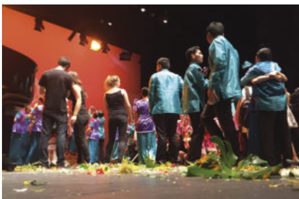
All the singers congratulate each other on a stage covered with flowers