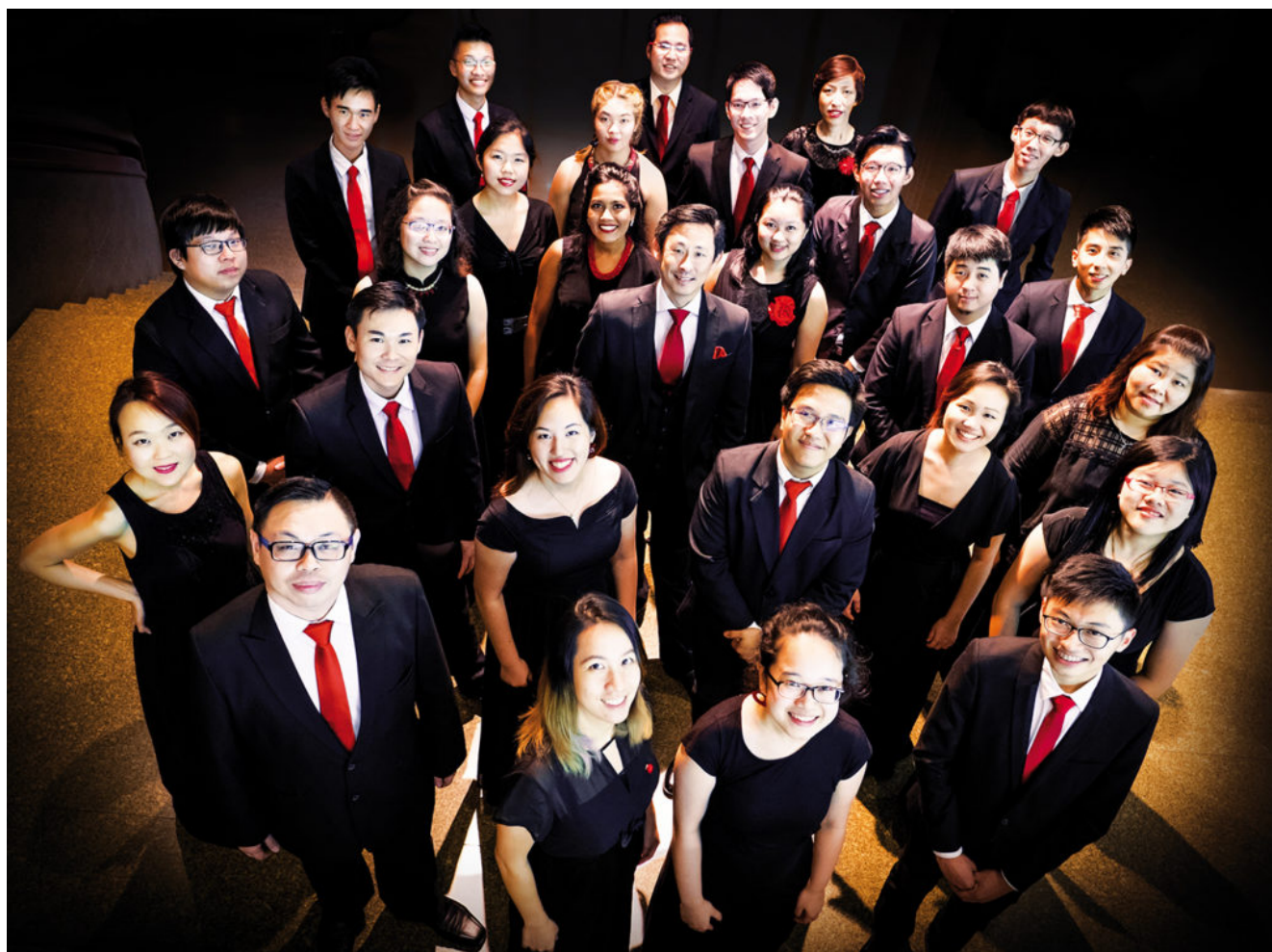
Raffles Singers, Singapore

in its construction. Declared a UNESCO World Heritage Site 20 years ago, the building is a homage to music and the proud historical traditions of Catalan music in particular. This splendid venue will host two of the official symposium concerts.