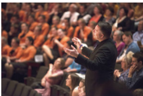
Conductor Tony Margeta, La Cappella, Sweden

music at a high international level through competitions and concerts. The inaugural festival took place in 2005 and was a success, paving the way for further festivals in 2007, 2009, 2010, 2011 and 2013, and now in 2016. Over the course of twelve years, more than 110 choirs from 24 countries have taken part in the festival. There was an expansion in 2009 with the addition of a new youth competition for solo voice. The 'NINA Solo Competition', for classically trained singers aged between 16 -24 years, was run for the first time in 2010 and subsequently in 2013 and 2016.