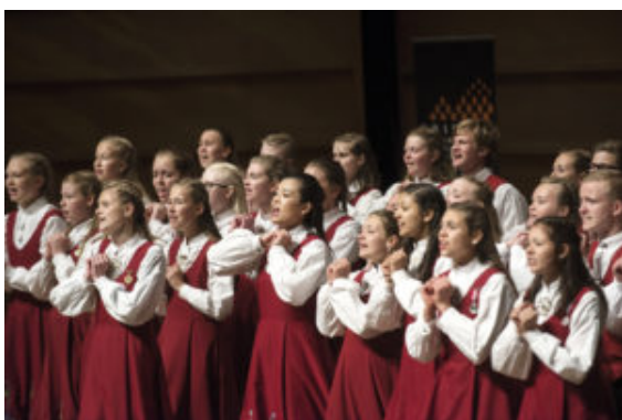
VIVA Sandnes kulturskolekor

With 30.000 members, the Norwegian Choir Association (NCA) is northern Europe's largest organization for choirs and choral conductors. It has a long tradition rooted in the strong, rich choral life of western Norway's Hordaland region. In 1987 it was the NCA that established Norway's first choir competition: 'Syng For Oss' ('Sing for us'). Set up as a biannual national competition open to a wide range of choirs from all kinds of backgrounds, it quickly grew to become an essential part of the country's choral life.