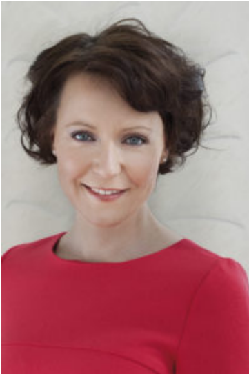
Mrs. Jenni Haukio, President's wife, Patron of the festival

We are very proud to announce that Mrs Jenni Haukio, the spouse of the President of the Republic of Finland, will be the patron of the festival.