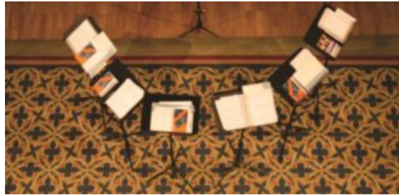
Awaiting Nordic Singers from the gallery

Kraja, allocated the Mendelssohn-Saal, is one of the more remarkable discoveries on the Swedish vocal music scene.