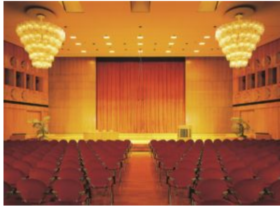
The Mendelssohn-Saal of the Gewandhaus – home to Amarcord

The opening concert of A Cappella Leipzig has become another tradition, if not such a long one, and is given by the city's local matadors Amarcord, sometimes in the Peterskirche but usually in the Mendelssohn-Saal of the Gewandhaus. This ensemble won Second Prize in the category 'Profane' at the Tolosa Choral Contest, Spain, back in 1995 and, in 1999, at the Tampere Vocal Music Festival, was awarded a joint Third Prize along with the Finnish group Tsakku.