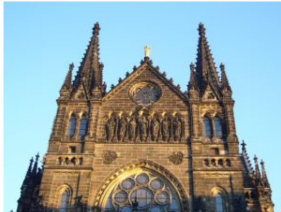
Leipzig's Neo-Gothic Peterskirche