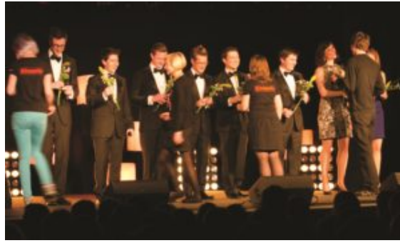
A post-concert VOCES8 – as suave as ever