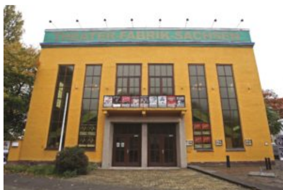
Exterior of the Theater-

The next evening belonged to VOCES8, the best of British as it were. The venue, on an industrial estate on the outskirts of Leipzig, was the Theater-Fabrik-Sachsen.