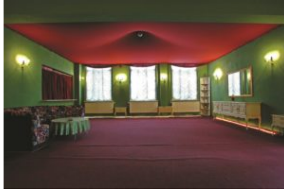
Theater-Fabrik-Sachsen foyer – reminiscent of another age