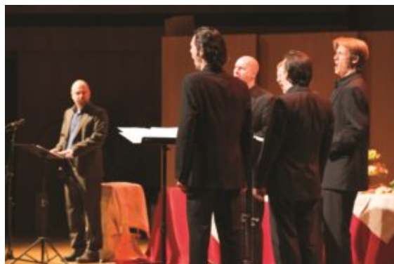
Members of the Ensemble Amarcord glance around

The opening concert of A Cappella Leipzig has become another tradition, if not such a long one, and is given by the city's local matadors Amarcord, sometimes in the Peterskirche but usually in the Mendelssohn-Saal of the Gewandhaus. This ensemble won Second Prize in the category 'Profane' at the Tolosa Choral Contest, Spain, back in 1995 and, in 1999, at the Tampere Vocal Music Festival, was awarded a joint Third Prize along with the Finnish group Tsakku.