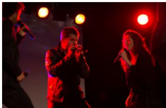
New crooners – Cap Pela in action

Back at the Theater-Fabrik-Sachsen, Cap Pela, from Majorca, were live in a concert that thrilled the audience. In addition to adaptations of popular songs from pop and film music they had brought along original Catalan settings too. Their vocal acrobatics are of the highest calibre and presented in a rousing stage show full of joy and abandon.