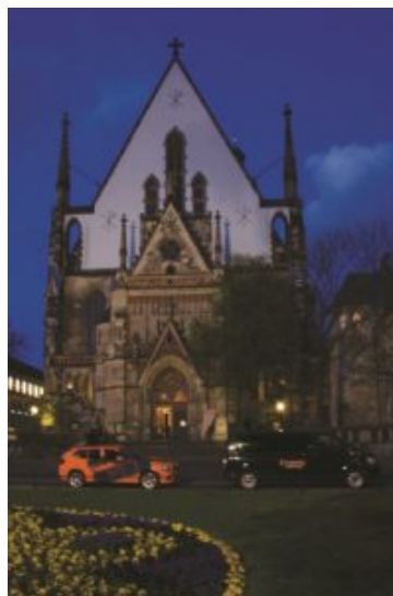
The famous Thomaskirche in twilight mood

For their Leipzig appearance in the Thomaskirche, Heinavanker combined movements from mass settings by Johannes Ockeghem (1417-1497) with ancient runic singing. Their concerts explore the relationship between the solemn contrapuntal masterpieces of the Renaissance that reflect the courtly, religious and scientific spirit of the era, and the meditative, monophonic and monastic music of the Middle Ages. The Estonian population is very small, and it is astonishing to note how many sacred choral pieces emanated so early on, works exhibiting strong folk influences the vitality of which reflects perhaps an early religious awakening. The corner stone of the Leipzig programme 'From Cloisters and Hovels' remained Ockeghem, whose at times arcane music achieves an extraordinary balance between hidden mathematical constructions and apparently spontaneous melodic lines. His works make such unusual demands on the singers that their performance is considered a test of courage. Pitted against this were folksong settings such as Haned kadunud or Loomine , the latter choreographed to excellent effect.