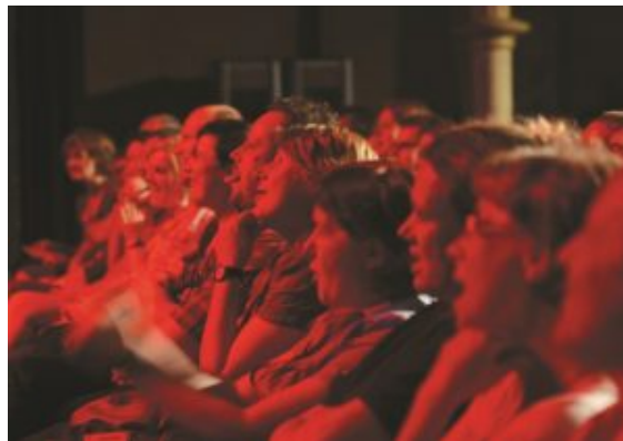
Cadence – fan club included

And indeed, some close harmonies, skilful imitation of instruments and rakish humour by these four charismatic Canadians were all designed to whisk us off from the Schaubühne Lindenfels into a 1940s American jazz club. Some refined interpretations of jazz classics turn out to be quite lively and they make them very much their own.