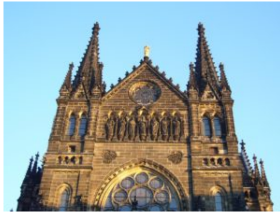
Leipzig's Neo-Gothic Peterskirche