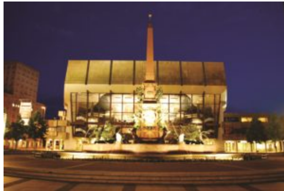
The world-renowned Gewandhaus Leipzig

The present incumbent, appointed in 1992, is Georg Christoph Biller, only the 16 th Thomaskantor in fact. And although the early evening Friday concert was not part of the festival programme proper, it seemed a good way in to a week of vocal music. The church was packed to the rafters, and I was one of the lucky few to be admitted just as the famous Thomanerchor, celebrating its 800 th anniversary in 2012, processed towards the altar. As in many a sacred building with a long musical tradition, the acoustics are so good that even in the rear pews the complex polyphony of the double motet Der Geist hilft unser Schwachheit auf , which Bach wrote in October 1729 for the funeral of the Rektor of the Thomasschule, Johann Heinrich Ernesti, was eminently clear.