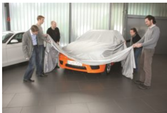
Amarcord unveiling the latest...