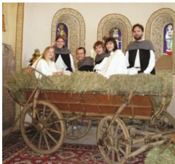
Heinavankar from Estonia, atop a bale of haymany

runic song from the Kadrina region simply called Loomiselaul (The Creation). It is about a bird that makes a nesting place in a paddock, lays eggs and hatches offspring. One of the fledglings becomes the sun, the second the moon, the third a star, and the fourth a rainbow. The vocal tradition associated with such songs possibly dates back many thousands of years.