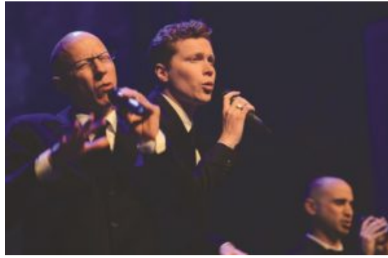
Cadence, from Canada – jazz as we know it

And indeed, some close harmonies, skilful imitation of instruments and rakish humour by these four charismatic Canadians were all designed to whisk us off from the Schaubühne Lindenfels into a 1940s American jazz club. Some refined interpretations of jazz classics turn out to be quite lively and they make them very much their own.