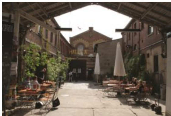
The Werk-2 venue Leipzig – a former factory

Jackson, the Bee Gees, Quincy Jones or the Red Hot Chili Peppers. These Polish newcomers stop at nothing and won over the jury and the audience at the A Cappella Competition last year in Leipzig. This year they rocked the Werk-2 venue. Apropos venue, Werk-2 was erected in 1848 to manufacture gasometers, was liquidated in 1952 and started producing mechanical materials testing machinery under the GDR regime, became an arts centre in 1992 after the reunification of Germany, before being acquired by the City of Leipzig in 1996 as a 'Socio-Cultural Centre'. The buildings were entirely renovated by Augustin & Imkamp in 2004. A year later saw the introduction of the 'Alternative Christmas Market', which has enjoyed great popularity since.