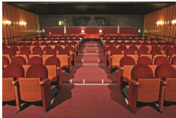
The plush interior of the Theater-Fabrik-Sachsen