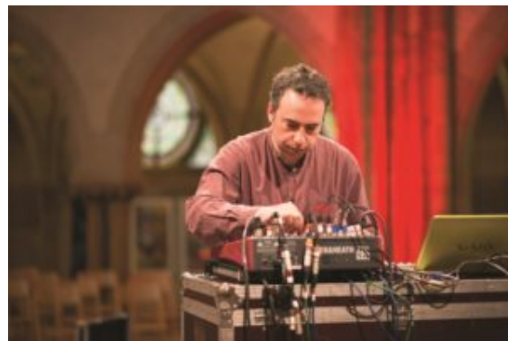
...with a little help from the engineerthe