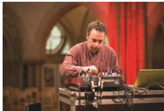
...with a little help from the engineerthe