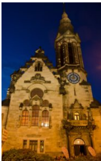
The Evangelisch-reformierte Kirche hosted Nordic Voices

onomatopoeic, many a natural phenomenon captured in the purest beauty of vocal sound.