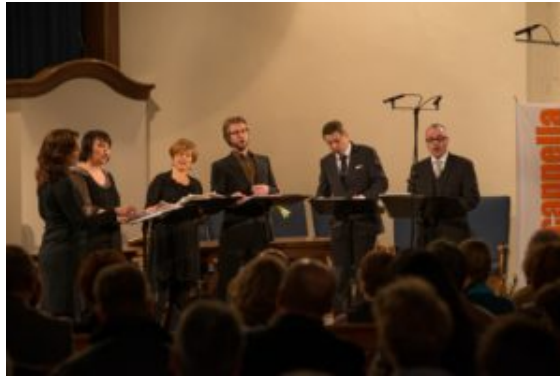
Nordic Voices in full flow