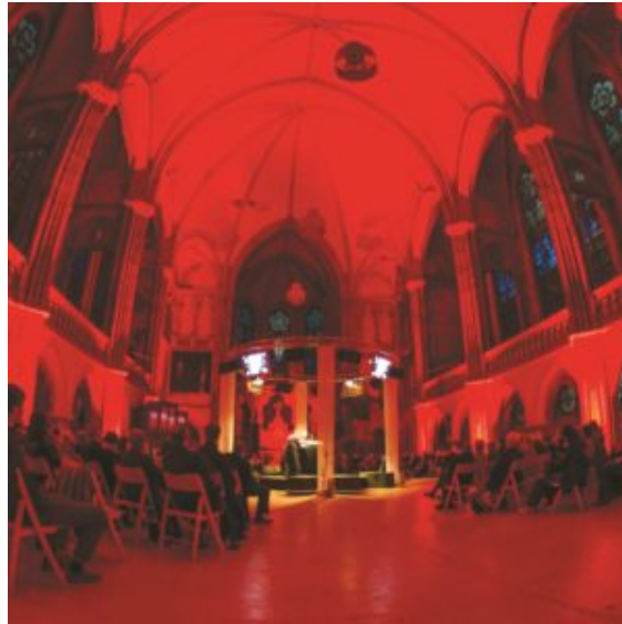
Interior of the Peterskirche in a new light