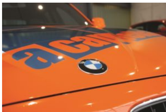
A Cappella Leipzig goes in for sleek transportation

excellent hosts rarely emerge from the kitchen and, when they do, hardly have time to look after themselves. One misses a central location too, where audience and performers alike can gather in the evenings, but this is a bigger city with many theatres, concert halls, churches and venues off the beaten track, and is just in the nature of things. A tendency, too, for increasing numbers of ensembles to work with microphones or actually 'on mike' more often than not is hardly a cause and more a symptom of a certain malaise in the genre. And a festival can hardly be responsible for this. The venue and its sound qualities play very much a determining role of course, but there is at least one well-known group that, for several decades now, has taken pride in always performing acoustic cappella music with only extremely rare exceptions where there simply might be no other choice.