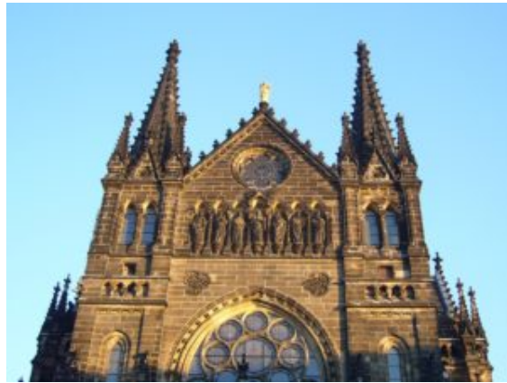
Leipzig's Neo-Gothic Peterskirche