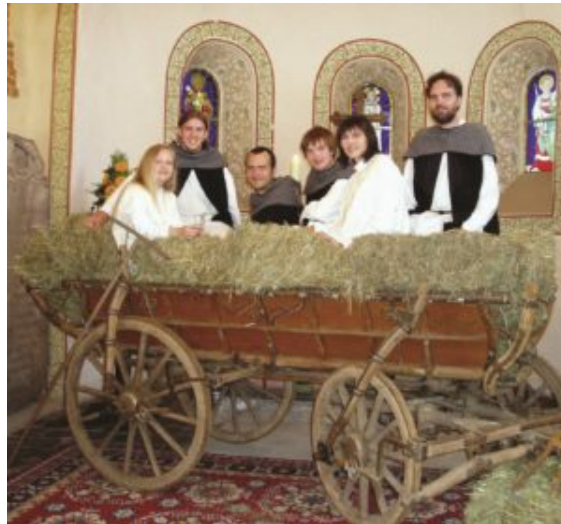
Heinavankar from Estonia, atop a bale of haymany

runic song from the Kadrina region simply called Loomiselaul (The Creation). It is about a bird that makes a nesting place in a paddock, lays eggs and hatches offspring. One of the fledglings becomes the sun, the second the moon, the third a star, and the fourth a rainbow. The vocal tradition associated with such songs possibly dates back many thousands of years.