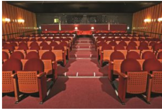
The plush interior of the Theater-Fabrik-Sachsen