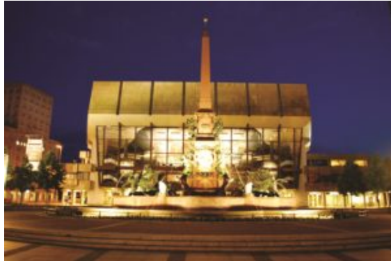
The world-renowned Gewandhaus Leipzig

The present incumbent, appointed in 1992, is Georg Christoph Biller, only the 16 th Thomaskantor in fact. And although the early evening Friday concert was not part of the festival programme proper, it seemed a good way in to a week of vocal music. The church was packed to the rafters, and I was one of the lucky few to be admitted just as the famous Thomanerchor, celebrating its 800 th anniversary in 2012, processed towards the altar. As in many a sacred building with a long musical tradition, the acoustics are so good that even in the rear pews the complex polyphony of the double motet Der Geist hilft unser Schwachheit auf , which Bach wrote in October 1729 for the funeral of the Rektor of the Thomasschule, Johann Heinrich Ernesti, was eminently clear.