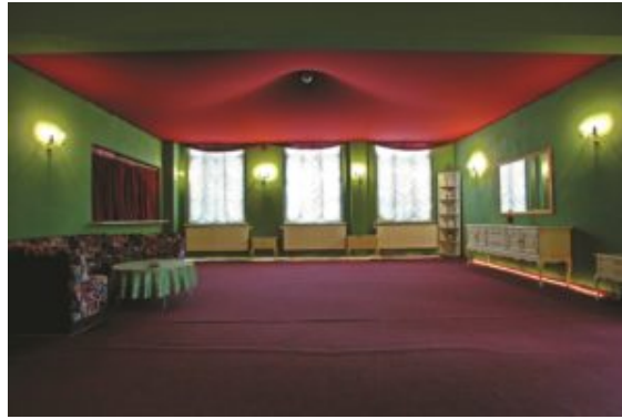
Theater-Fabrik-Sachsen foyer – reminiscent of another age