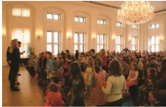
LALÁ captivates even the youngest audience members

what a good idea this is too. No sooner than they enter the stage, LALÁ leave on a whimsical flight of fancy, their moving tales transported on the wings of song and helping listeners young and old alike connect tangibly to the a cappella art.