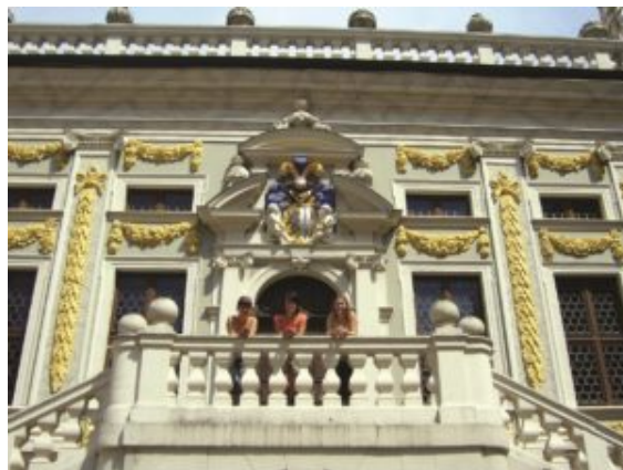
The 'Alte Handelsbörse', a stock exchange in Early Baroque style

Strolling around Leipzig next day I made a determined effort to avoid the many building sites and tourist hot spots like the 'Zillstunnel', where guests sit outside shoulder to shoulder in different establishments that have become just one long and rather indifferent restaurant. But as the Alte Handelsbörse came into view, I felt rewarded. Who needs Wall Street? The 'Old Stock Exchange' was completed in 1687 at the end of the Thirty Years War and is in the Early Baroque style; it was designed as a representative building where merchants from all over the world could meet. Today it hosts scientific lectures, company conferences and private receptions, but also many literary and musical events.