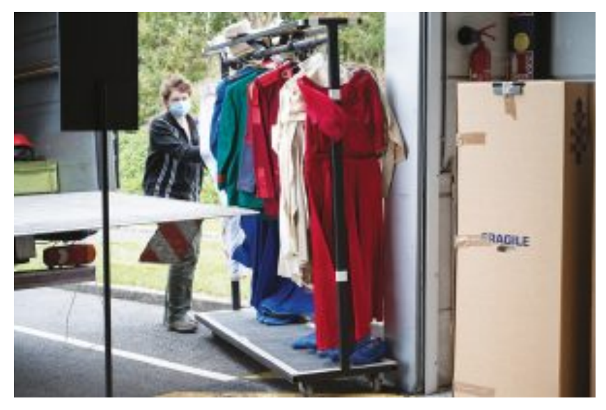
Donation of costumes

Since 2015, the Opéra de Lille (northern France) has put environmental sustainability high on its list of priorities.