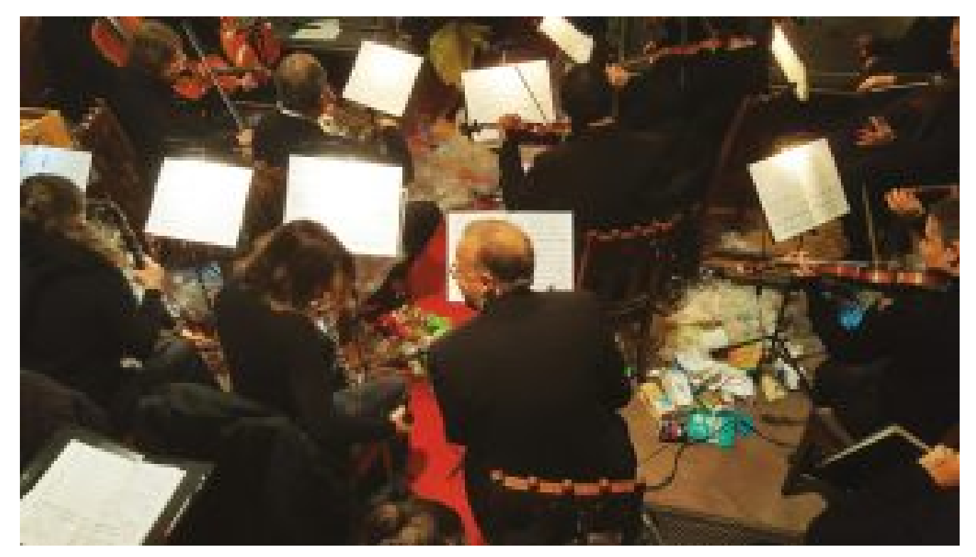
Ev luth. Kirchengemeinde Mölln