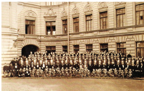
The whole staff of the Court Capella in St. Petersburg at the beginning of the XX century

The accessibility of training in church singing to people of different social classes made it possible to select singers for professional choirs. Not surprisingly, the Court Cappella had singers who were richly, naturally gifted. Vocal and musical training was also taken very seriously by the Cappella. Singers acquired such strong vocal skills that they could successfully handle solo parts in the Italian operas if necessary.