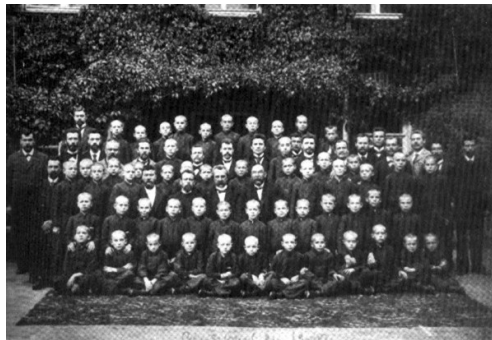
Synodal Choir (1900)

At this time, trends in the art of folk singing were also actively developing. An important role in the history of Russian folk choir development was played by a magnificent choir of peasants led by Ivan Molchanov (1808-1881). A gifted teacher, Molchanov came to incorporate child singers into the choir and also taught them music theory and musical notation. At the domestic level, the "Choir College" was formed, fostering a veritable galaxy of Russian folk singers and choir masters. Also notable among 19 th -century folk choirs are those of Dmitry Agrenev-Slavyansky (1836-1908), Peter Yarkov (1875-1945), and Mitrofan Pyatnitsky (1864-1927).