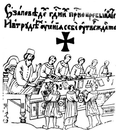
Old Russian singing school