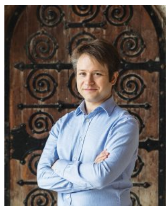
Mihaly Zeke © Gergely Maté Olań

Cythera is a European chamber choir founded by Mihály Zeke in 2019 following his years at the head of Arsys Bourgogne. Cythera was born out of the desire to form a new group of international composition and open to new forms of artistic collaboration. The ensemble's size varies around an average of 24 singers according to each different project. The choir is dedicated to bringing the best choral music, old and new, to audiences while striving for the highest standard of technical quality and for passionate expressiveness. Cythera's singers, chosen for their unique artistic personality, are marked by high individual skill as soloists in a wide range of repertoire as well as by their capacity to blend into a homogeneous sound.