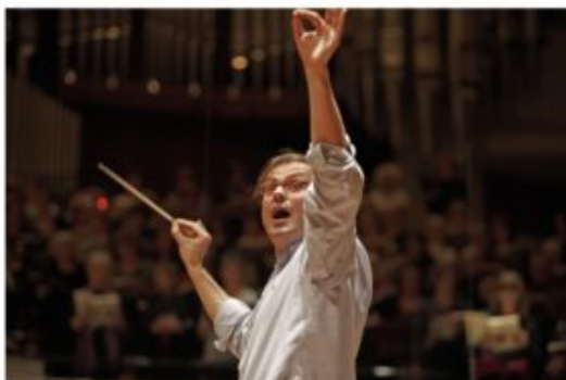
Simon Halsey, artist in residence of chor.com