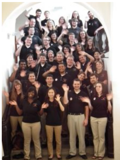
University of Louisville Cardinal Singers on a day trip to the Lautrach Castle

to boot); the Female Choir of Kiev Glier Institute of Music, Ukraine; Kamerkoor Cantate Venlo, The Netherlands; and the Female Choir of Estonian Choral Conductors, Tallinn, Estonia.