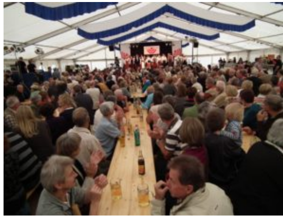
Female Choir of Estonian Choral Conductors in the beer tent on Whit Monday

There were two categories in the 2011 competition: A – Mixed Choirs, and B – Female Choirs. These were, in order of appearance in the First Round: Jerusalem Academy Chamber Choir, Israel; Cantabile, Regensburg, Germany; Coro Entrevoces, Havana, Cuba; University of Louisville Cardinal Singers, USA; molto cantabile, Lucerne, Switzerland; University of the East Chorale, Manila, The Philippines; Kammerchor der Hochschule für Musik Detmold, Germany; S:t Jacobs Ungdomskör, Stockholm, Sweden (the mixed voice choirs); and (the women's choirs) VokalArs, Madrid, Spain (with a tenor