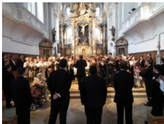
University of Louisville Cardinal Singers performing in surround sound in the Church of St. Martin Marktoberdorf

People streamed out to the foyer, dismissed sugar in their coffee. Jaded arguments spawned new camaraderie and reignited ancient disputes. Discussion focussed less on repertoire and style but more on presentation and the desire to hear within each work a story being told. Was this dressage with abandon