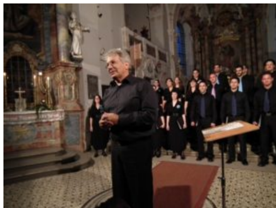
Jerusalem Academy Chamber

One was spoiled for choice in the plausible intimacy of the evening, with concerts close by in churches created not out of vanity or pious fear but the craftsman's pride: Ottobeuren, Kaufbeuren, Kempten, Altenstadt, Seeg, Nesselwang, Wildpoldsried, as well as in Marktoberdorf itself. I hitched a ride to the Basilica of St. Michael in Altenstadt: 6pm, time enough to traipse the couple of miles along a footpath for supper at an hospitable "Gaststätte". But it was a dislocated sensation to be the only non-invited guest at the village wedding celebrations. Apropos Altenstadt, the building dates from the 12 th century and has enjoyed doting restoration, its spacious but not vibrant acoustics perfect for the choirs from Jerusalem, Madrid and Stockholm. Just one full house of many.