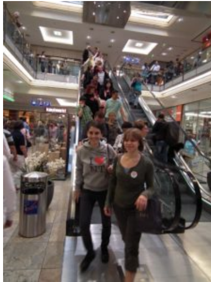
Flash mob in the local supermarket