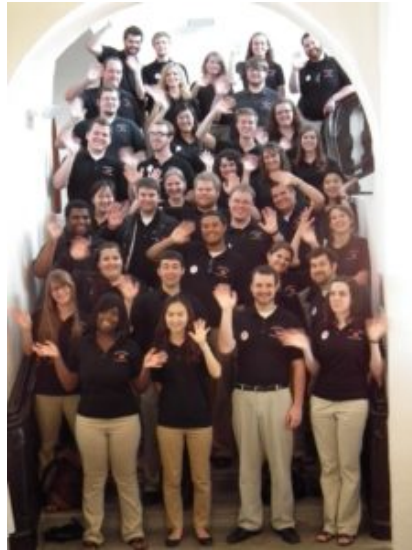
University of Louisville Cardinal Singers on a day trip to the Lautrach Castle

to boot); the Female Choir of Kiev Glier Institute of Music, Ukraine; Kamerkoor Cantate Venlo, The Netherlands; and the Female Choir of Estonian Choral Conductors, Tallinn, Estonia.