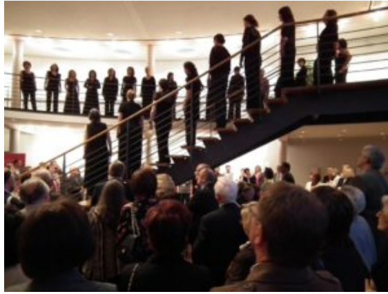
VokalArs Madrid singing for sponsors in the foyer of the Bavarian Music Academy Marktoberdorf

Standards were seriously high. Each choir sounded like a winner. And it took the compulsory work, Rhapsodia , by Joseph Gabriel Rheinberger, to help audience and jury alike form more differentiated opinions. But at the end of the long day, other factors began to play a role: such as just which pieces work best in the slightly unforgiving acoustics of the MODEON.