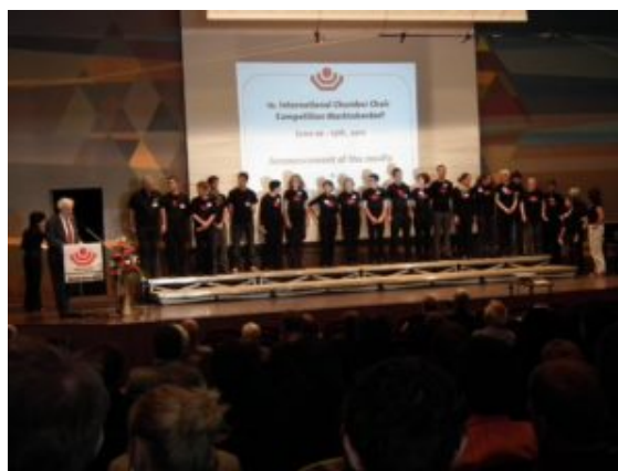
Introducing competition staff during the prize giving ceremony in the MODEON Marktoberdorf

Standards were seriously high. Each choir sounded like a winner. And it took the compulsory work, Rhapsodia , by Joseph Gabriel Rheinberger, to help audience and jury alike form more differentiated opinions. But at the end of the long day, other factors began to play a role: such as just which pieces work best in the slightly unforgiving acoustics of the MODEON.