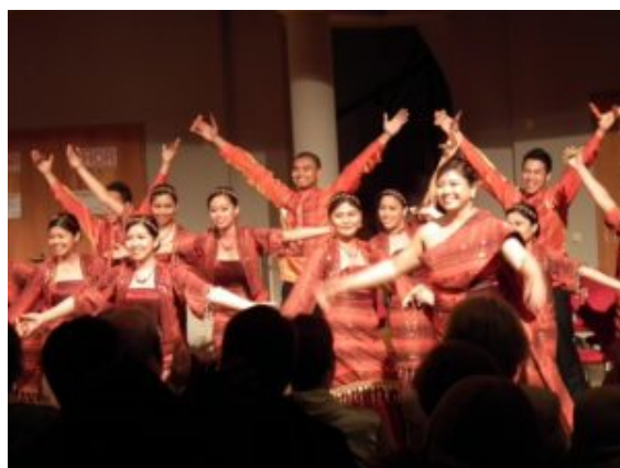
University of the East Chorale in the Bavarian Music Academy Marktoberdorf