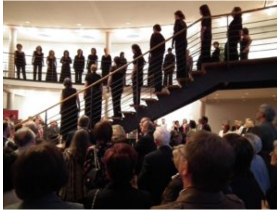
VokalArs Madrid singing for sponsors in the foyer of the Bavarian Music Academy Marktoberdorf

Standards were seriously high. Each choir sounded like a winner. And it took the compulsory work, Rhapsodia , by Joseph Gabriel Rheinberger, to help audience and jury alike form more differentiated opinions. But at the end of the long day, other factors began to play a role: such as just which pieces work best in the slightly unforgiving acoustics of the MODEON.