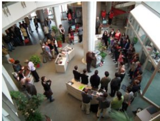
Jerusalem Academy Chamber Choir performing in the local bank – the Sparkasse Marktoberdorf

The competition events suspended any sense of temporal juncture. Customers at the local bank were treated to the a cappella art. And there was a surprise in store, as it were, for shoppers in the “Einkaufszentrum Forum Allgäu”, stormed by a flash mob of some 400 singers. They occupied the moving staircases, leant perilously against the gallery railings, before letting loose with “Freude schöner Götter Funken”. A perplexing diversion for those buying in the fruit and veg.