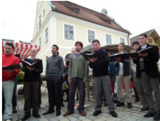
Jerusalem Academy Chamber Choir singing on the market square Marktoberdorf