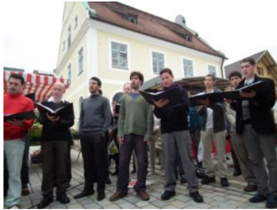
Jerusalem Academy Chamber Choir singing on the market square Marktoberdorf