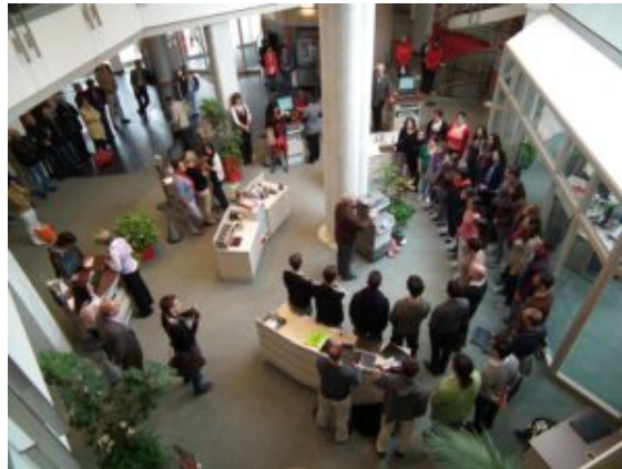
Jerusalem Academy Chamber Choir performing in the local bank – the Sparkasse Marktoberdorf

The competition events suspended any sense of temporal juncture. Customers at the local bank were treated to the a cappella art. And there was a surprise in store, as it were, for shoppers in the “Einkaufszentrum Forum Allgäu”, stormed by a flash mob of some 400 singers. They occupied the moving staircases, leant perilously against the gallery railings, before letting loose with “Freude schöner Götter Funken”. A perplexing diversion for those buying in the fruit and veg.