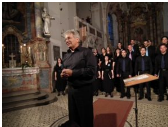
Jerusalem Academy Chamber

One was spoiled for choice in the plausible intimacy of the evening, with concerts close by in churches created not out of vanity or pious fear but the craftsman's pride: Ottobeuren, Kaufbeuren, Kempten, Altenstadt, Seeg, Nesselwang, Wildpoldsried, as well as in Marktoberdorf itself. I hitched a ride to the Basilica of St. Michael in Altenstadt: 6pm, time enough to traipse the couple of miles along a footpath for supper at an hospitable "Gaststätte". But it was a dislocated sensation to be the only non-invited guest at the village wedding celebrations. Apropos Altenstadt, the building dates from the 12 th century and has enjoyed dotting restoration, its spacious but not vibrant acoustics perfect for the choirs from Jerusalem, Madrid and Stockholm. Just one full house of many.