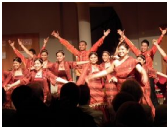
University of the East Chorale in the Bavarian Music Academy Marktoberdorf