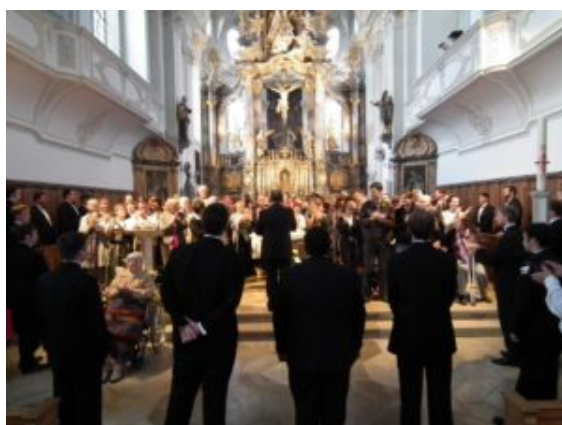
University of Louisville Cardinal Singers performing in surround sound in the Church of St. Martin Marktoberdorf

People streamed out to the foyer, dismissed sugar in their coffee. Jaded arguments spawned new camaraderie and reignited ancient disputes. Discussion focussed less on repertoire and style but more on presentation and the desire to hear within each work a story being told. Was this dressage with abandon