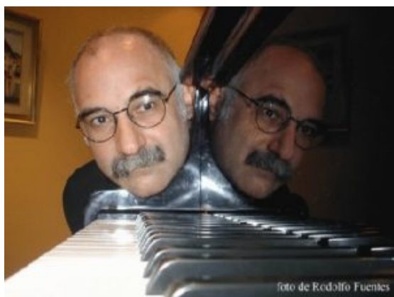
Leo Masliah, Uruguay.

California, USA, related to computer music composition. He has given courses and lectures in composition and musical analysis in several European and American countries for the last 40 years. His instrumental and electroacoustic music have been performed worldwide. Articles and papers of his on different musical subjects have appeared in many specialized publications.