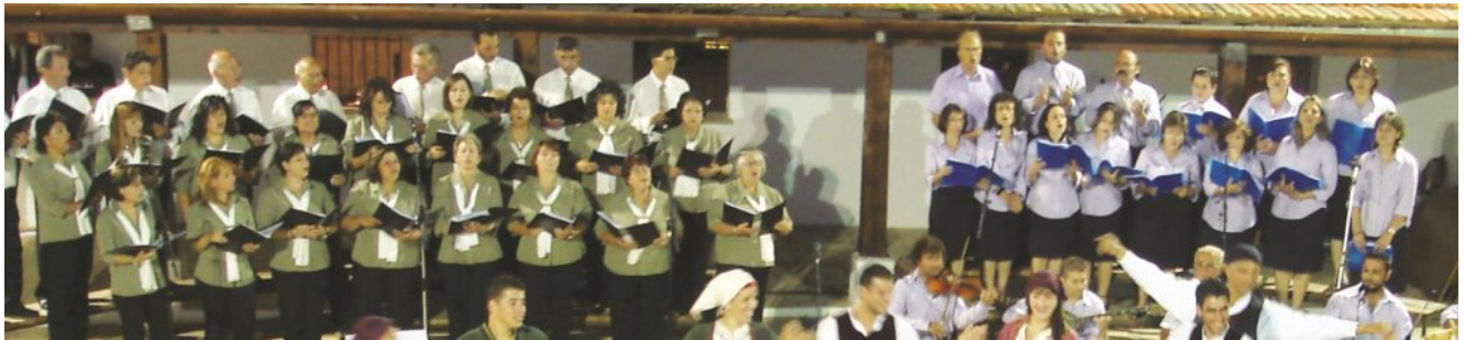
Concert by the Choirs "Ermis Aradippou" and "Kimon Xylotympou"