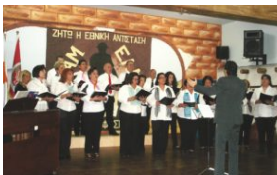
Concert by the Choir of

The final years of the 20th century witnessed the creation of many new vocal groups, including mixed, local, national and children's groups, as well as choirs with a particular focus, for example those that base their repertoire around patriotic songs. The founders of these choirs have variously aimed to shape people's artistic hopes and expectations, to develop popular folk songs or to put on artistic representations of traditional folk music. It would be impossible to mention all of the choirs that are currently active on the island, but special recognition must go to: the Epilogy Cultural Society, which includes three ensembles and is conducted by Angelina Spanou-Nicolaidoul; the Modern Times Choir, conducted by Nicos Vihas; the Choir of the Musical Society of Paphos, conducted by Sotiris Karagiorgis; the Choir of the Cultural Society Ermis Aradippou, conducted by Michalis Pagoni; the Proodevtiki Larnakas Choir, conducted by Marios Lysandrou; the Choir of the Cultural Society of Limassol, which includes two ensembles and is conducted by Violetta Kakomanoli and Maria Kapetanidou; and the Choir of the Evagoras Music Ensemble, conducted by Loucas Zymaras.