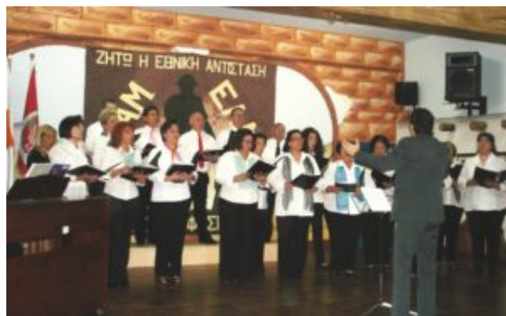
Concert by the Choir of

The final years of the 20th century witnessed the creation of many new vocal groups, including mixed, local, national and children's groups, as well as choirs with a particular focus, for example those that base their repertoire around patriotic songs. The founders of these choirs have variously aimed to shape people's artistic hopes and expectations, to develop popular folk songs or to put on artistic representations of traditional folk music. It would be impossible to mention all of the choirs that are currently active on the island, but special recognition must go to: the Epilogy Cultural Society, which includes three ensembles and is conducted by Angelina Spanou-Nicolaidoul; the Modern Times Choir, conducted by Nicos Vihas; the Choir of the Musical Society of Paphos, conducted by Sotiris Karagiorgis; the Choir of the Cultural Society Ermis Aradippou, conducted by Michalis Pagoni; the Proodevtiki Larnakas Choir, conducted by Marios Lysandrou; the Choir of the Cultural Society of Limassol, which includes two ensembles and is conducted by Violetta Kakomanoli and Maria Kapetanidou; and the Choir of the Evagoras Music Ensemble, conducted by Loucas Zymaras.