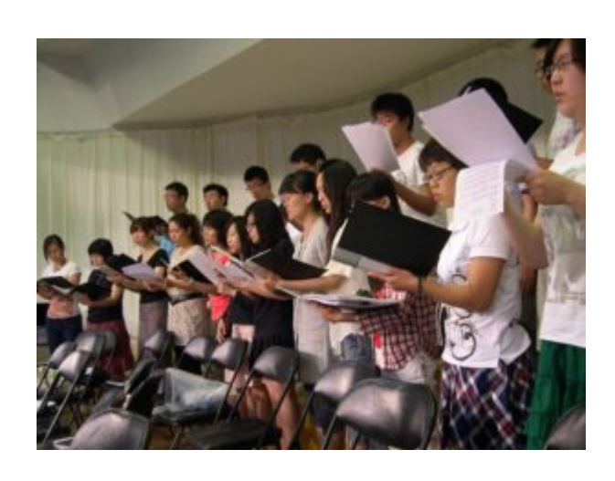
Prof. Tong Shiu-wai Leon

To conclude, current Chinese choirs must first step onto the road of popular aesthetic culture and then upgrade themselves from popularism to elite choral work. I believe contemporary Chinese choirs must go through all these steps — an historical process to achieve sustainable prosperity and development.