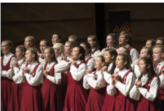
VIVA Sandnes kulturskolekor

With 30.000 members, the Norwegian Choir Association (NCA) is northern Europe's largest organization for choirs and choral conductors. It has a long tradition rooted in the strong, rich choral life of western Norway's Hordaland region. In 1987 it was the NCA that established Norway's first choir competition: 'Syng For Oss' ('Sing for us'). Set up as a biannual national competition open to a wide range of choirs from all kinds of backgrounds, it quickly grew to become an essential part of the country's choral life.