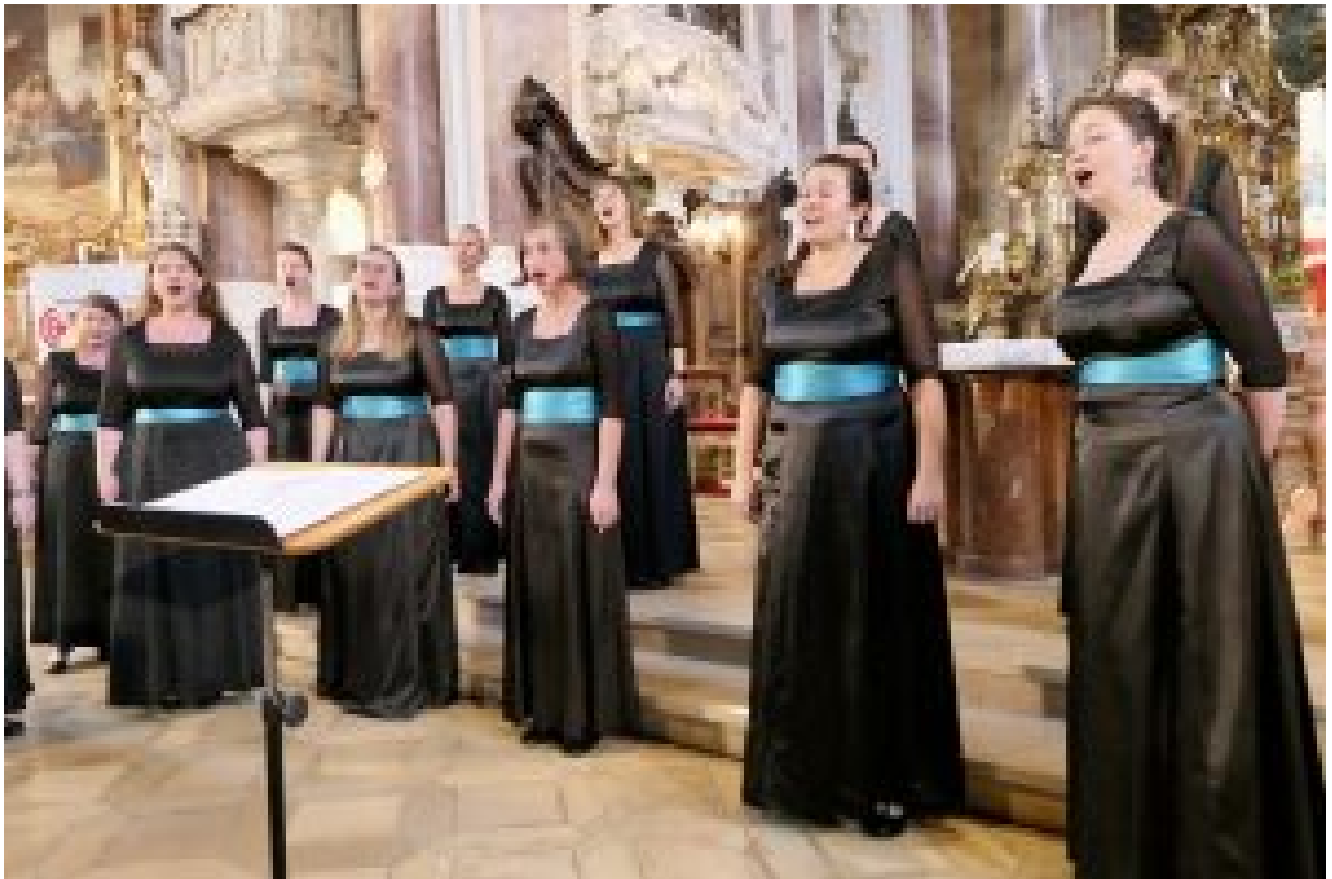
Women choir of the Technical University Ostrava

In her welcome address, Claudia Roth, the Federal Government Commissioner for Culture and the Media, described the ICCC as a “musical festival”: In fact, this competition, which participants and observers like to describe as a “family reunion”, is characterized by inimitable emotional closeness. Not only does the enchanting backdrop of the Allgäu contribute to this, but also the enormously high level of support from the residents of Marktoberdorf, who take the singers into their host families and listen intently to the competition rounds, as well as the large number of volunteers who support the competition professionally.