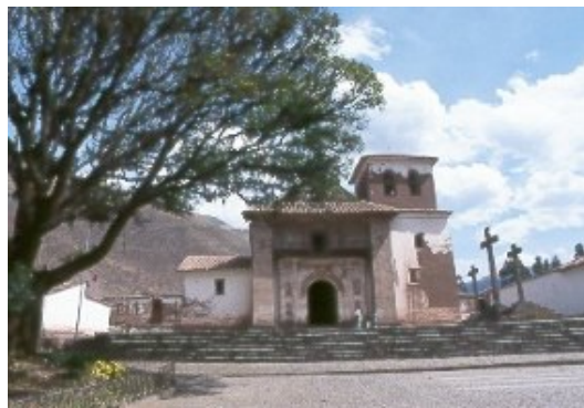
The little chapel of San Pedro de Andahuailillas