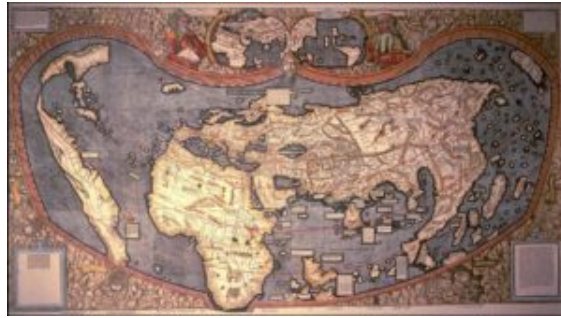
America in Martin Waldseemüller's map

However, this does not change the origin and development of the Indiana culture that has influenced the music of the Western Hemisphere in many ways.