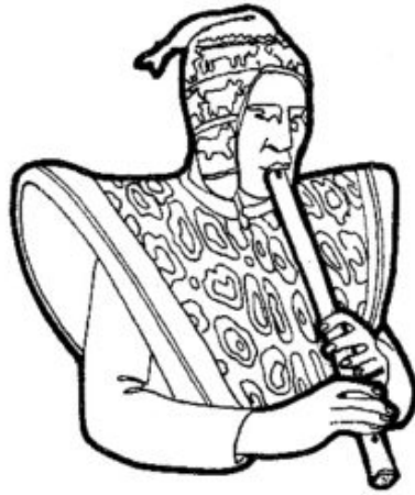
Man playing a "quena", an aerophone made of cane