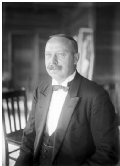
Olexander Koshetz (1875-1944)

Olexander Koshetz (1875-1944) made a significant contribution to Romantic period Ukrainian choral culture.