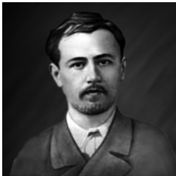
Mykola Dmytrovych Leontovych (1877-1921)

Mykola Leontovych (1877-1921) is one of the best known Ukrainian composers of the twentieth century. His famous Shchedryk (Carol of the Bells) may still be heard at Christmas in many countries.