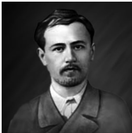
Mykola Dmytrovych Leontovych (1877-1921)

Mykola Leontovych (1877-1921) is one of the best known Ukrainian composers of the twentieth century. His famous Shchedryk (Carol of the Bells) may still be heard at Christmas in many countries.