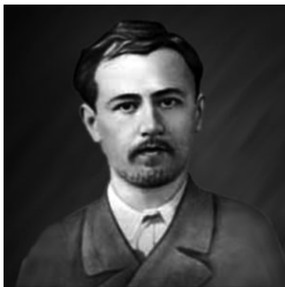
Mykola Dmytrovych Leontovych (1877-1921)

Mykola Leontovych (1877-1921) is one of the best known Ukrainian composers of the twentieth century. His famous Shchedryk (Carol of the Bells) may still be heard at Christmas in many countries.