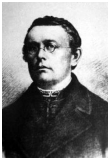
Mykhailo Mykhailovych Verbytsky (1815-1870)