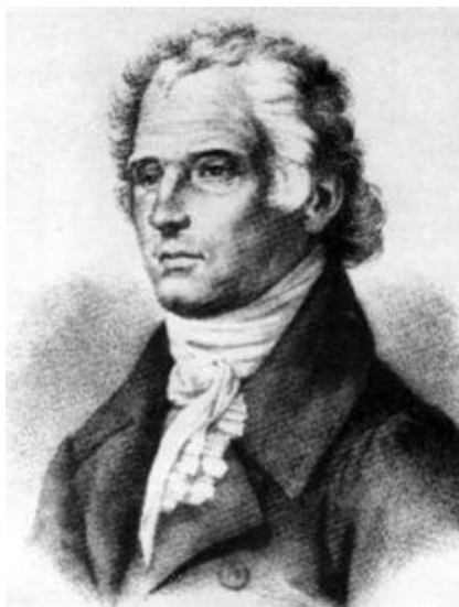
Dmytro Bortniansky (1751-1825)

The creativity of Berezovsky generated the genre of the Ukrainian choral concerto. He was born in 1745 in Hlukhiv, then capital of the Ukrainian Hetmanate and Left-bank Ukraine. He obtained a sound education, first in the Hlukhiv School of Music which had prepared singers for court choirs, and then at the Kyiv-Mohyla Academy. From 1758 Berezovsky was a court singer in the Italian troupe of Prince Pyotr Fyodorovich (the future Peter III) and also sang in the court choir chapel directed by the well-known Ukrainian musician Marko Poltoratsky and the Italian composer Baldassare Galuppi. During this period, musicians learned music theory from the conductor of the Summer Palace Theatre, Francesco Zoppis, a representative of the Venetian school. In 1769, Berezovsky was sent to Italy where he studied at the Philharmonic Academy of Bologna with Padre Martini. In 1771, he graduated with distinction, received the highest academic title accademico compositore and was admitted as a Member of the Academy.