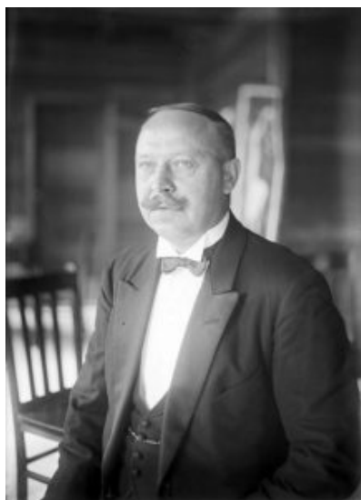
Olexander Koshetz (1875-1944)

Olexander Koshetz (1875-1944) made a significant contribution to Romantic period Ukrainian choral culture.