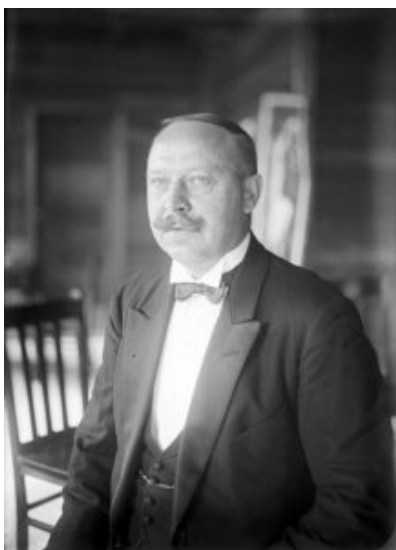
Olexander Koshetz (1875-1944)

Olexander Koshetz (1875-1944) made a significant contribution to Romantic period Ukrainian choral culture.