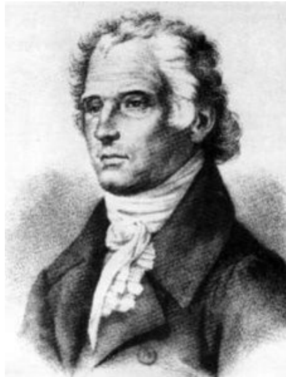
Dmytro Bortniansky (1751-1825)