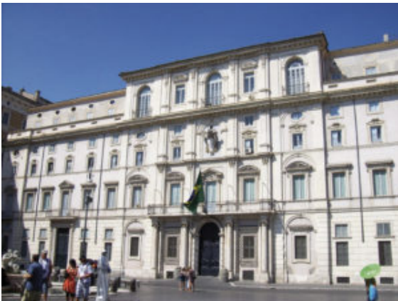
Palazzo Doria-Pamphilj (Illustration 4)

Nor was it under the roof of a church that the Messiah did eventually get staged in Rome for the first time, but within the framework of a select musical society, the so-called Società musicale romana . This society was an academic musical association particularly keen on supporting “early music”. In