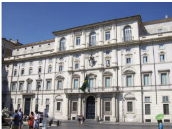
Palazzo Doria-Pamphilj (Illustration 4)

Nor was it under the roof of a church that the Messiah did eventually get staged in Rome for the first time, but within the framework of a select musical society, the so-called Società musicale romana . This society was an academic musical association particularly keen on supporting “early music”. In