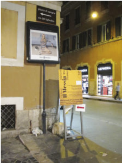
Poster of the Concert in Rome (Illustration 10)

The International Choir Academy 2015 was run in close co-operation with the Italian cultural organisation BISSE in Spoleto. This would have been impossible without financial support by the Goethe-Institute [an official German institution with branches all over the world, working to spread knowledge and understanding of German culture and the German language – translator] as well as the Foreign Office of the Federal Republic of Germany. Two orchestras were available: the Junges Philharmonisches Orchester Niedersachsen and the chamber ensemble of the Accademia Santa Cecilia di Roma .