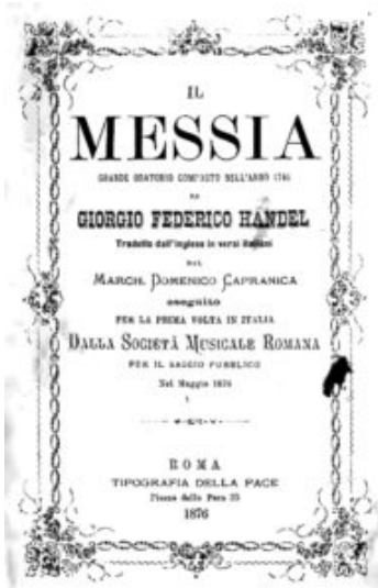
Program booklet dated 5 May 1876 (Illustration 6)