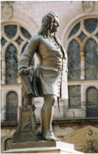
Handel Statue in Halle (Illustration 2)

Handel (Illustration 2) had composed the great oratorio in 1741 and had it performed in the years that followed first in Ireland and then in London. Within a few decades it had then also spread abroad, reaching Florence in 1768, 1770 New York and Hamburg in 1772. Within only a few decades the Messiah had conquered many – and, in the 19th century, nearly all – the important musical cities of the Christian world – not, however, the world centre of church music: in Rome the oratorio was only first heard in 1876, after it had already been performed for a long time in every nook and cranny of the world, and more than 130 years after its creation. Why so late? We would have expected the work really to have been accepted immediately into the musical repertoire of the Roman churches because of its thoroughly spiritual subject – after all it retells the life story of the Saviour.