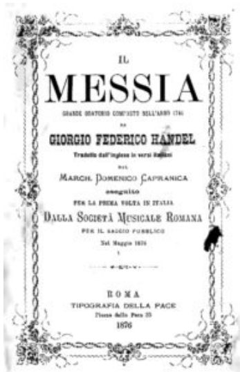
Program booklet dated 5 May 1876 (Illustration 6)