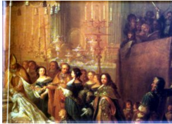
Joseph Cristophe, Baptism of the Dauphin in the presence of Lully, oil on canvas, Versailles, the castle museum, in Ritratti di compositori, Officine grafiche De Agostini, Novara 1990, pp. 42-43 (various authors, edited by G.Taborelli and V.Crespi)

In deciding where to place the choir much depends, and has always depended, on the conductor's style of directing. The use, or non-use, of the conductor's baton, and the development of a theory of conducting, have been determining factors in the choice of one position on stage rather than another: in front of the orchestra, behind it, or to one side.