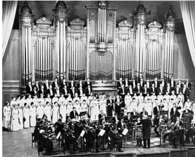
Concert of the State Academic Russian Choir of the USSR

Many of the Soviet authorities felt that there was a great need to create the 'perfect choir' – the one which would be a benchmark for the professional and amateur groups of the country. The choice, oddly enough, did not fall on an existing choir of a large organization, but on the vocal ensemble at the All-Union Radio. The group's task was, first of all, the propaganda of Soviet music, actively produced during those years in a variety of genres – from cantatas and oratorios to songs and choral miniatures. However, a significant place in the repertoire of the choir was given to Russian and foreign choral classics, which gave the repertoire an extra dimension and made this group almost universal.