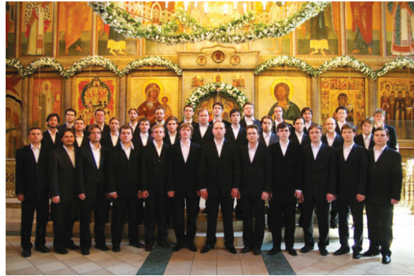
Moscow Sretensky Monastery Choir

One should not be surprised by the professional skills of these groups, as many graduates of the conducting and choral departments of conservatories and other top music schools Russia are now working in church choirs. The Russian Orthodox Church to this day remains the largest employer of professional choral singers and conductors.