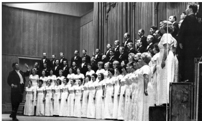
Capella Choir concert under the baton of Alexander Yurlov

Russian Choir, at one time considered a direct competitor of the State Choir, despite the fact that it was subordinate to republican authorities, and not to the Union.