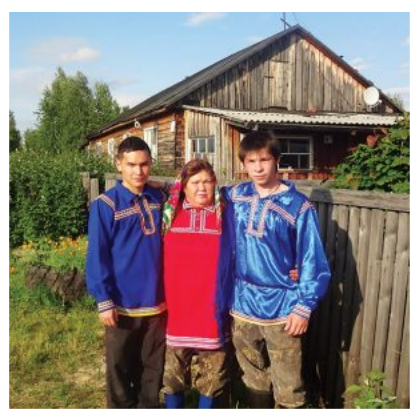
Khanty family

Hungarian children's rhymes and playing songs are quite different from this phenomenon. The rhythm takes precedence in their structure of pairs of beats or motifs. Therefore, the emphasis and segments of the text are often shifted which can also make it difficult to understand the content.