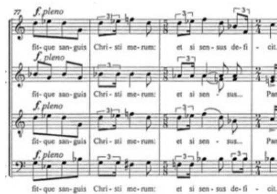
Figure 8. Orban, "Pange lingua," m. 77-80

(Click on the image to download the full score)