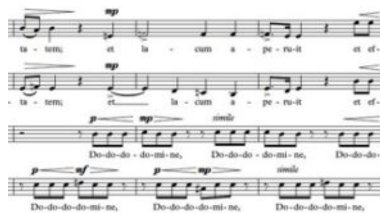
Figure 10. Gyöngyösi, "Domine Deus meus," m. 29-31

(Click on the image to download the full score)