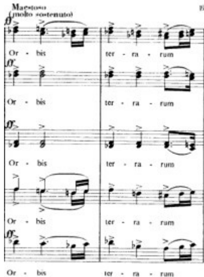
Figure 6. Szokolay, "Cantate Domino," m. 95-96

(Click on the image to download the full score)