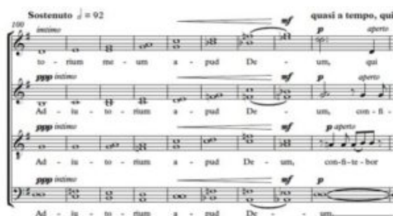
Figure 11. Gyöngyösi, "Domine Deus meus," m. 100-108

(Click on the image to download the full score)