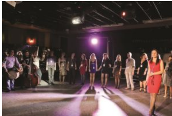
Evening concert at the disco

Of course, if you plan to participate in the forum next year, be prepared to taste the local vodka, of which the Belarusians are very proud! The famous 'Kristall' distillery was almost in front of my hotel and its intense scents, seeping through the air conditioning, can truly stun you!! Jokes apart, the third glass of vodka offered to me during the final party was politely declined for obvious reasons. It has been fascinating, however, to see how, around me, our Russian and Belarusians colleagues could still remain almost perfectly sober even after many toasts in honour of someone or something!