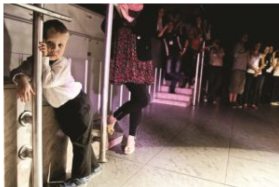
The youngest guest at the