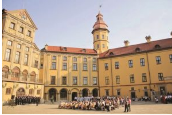
Concert in the castle courtyard

the courtyard of the magnificent, recently restored Nesvizh castle, a hundred miles southwest of Minsk. This place is famous because in 1562 the first book in the Belarusian language was printed there.