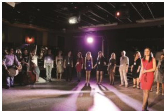
Evening concert at the disco

Of course, if you plan to participate in the forum next year, be prepared to taste the local vodka, of which the Belarusians are very proud! The famous 'Kristall' distillery was almost in front of my hotel and its intense scents, seeping through the air conditioning, can truly stun you!! Jokes apart, the third glass of vodka offered to me during the final party was politely declined for obvious reasons. It has been fascinating, however, to see how, around me, our Russian and Belarusians colleagues could still remain almost perfectly sober even after many toasts in honour of someone or something!