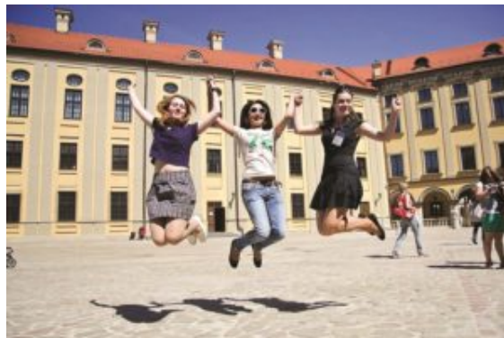
Good spirits before the concert...