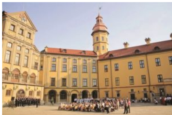
Concert in the castle courtyard

the courtyard of the magnificent, recently restored Nesvizh castle, a hundred miles southwest of Minsk. This place is famous because in 1562 the first book in the Belarusian language was printed there.