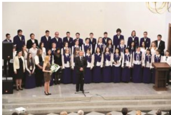
The final awards ceremony

The grand finale consisted of the awards ceremony for the participating choirs and a superb gala concert, during which the pieces studied in the masterclasses were performed by the students.