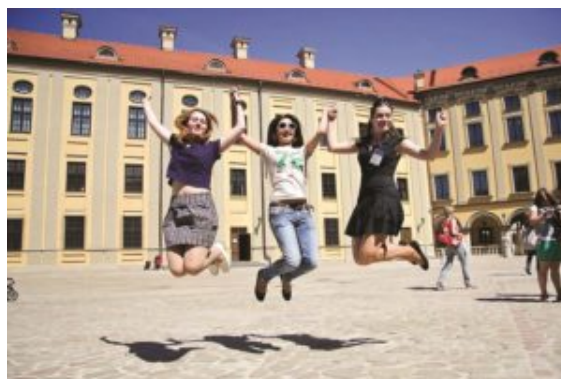
Good spirits before the concert...