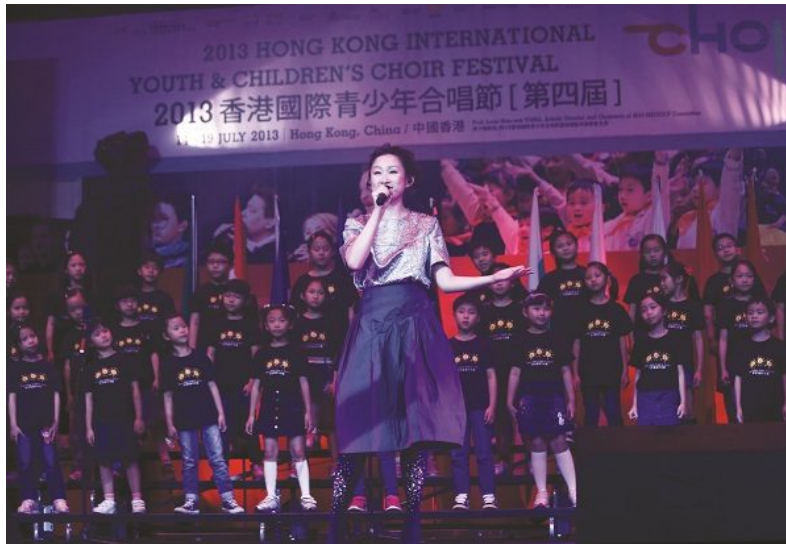
Miss Ivana Wong, a famous pop singer in Hong Kong, singing with the Hong Kong Treble Choir (Hong Kong, China)

Two salute concerts were held, dedicated to the outstanding Hong Kong choirs for their prominent performances in international competitions and their contributions to the development of choral music in Hong Kong. The C.C.C. Kei Wan Primary School Choir, Yuen Long Children's Choir, Marymount Secondary School Choir and Yuen Long District Arts Committee Treble Choir were invited.