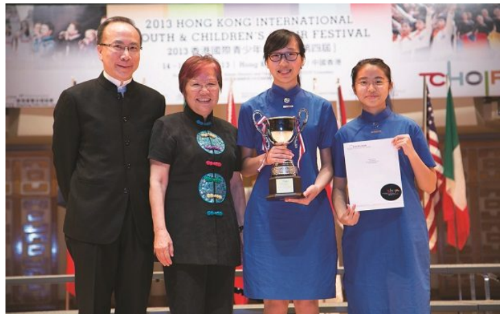
2013 HKIYCCF Outstanding Conductor Award, CASH Best Commissioned Piece, Mr. Ka-ki Lee Memorial Trophy – Best Interpretation and Champion of Contemporary Music, any voice combination (age 29 or under): Heep Yunn School Choir (Hong Kong, China)