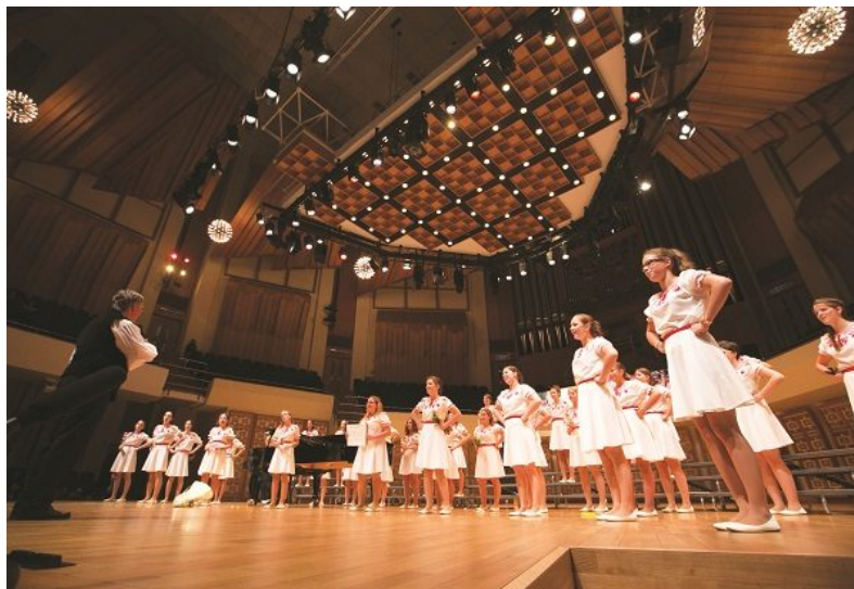
World-class Choirs Series III – Cantemus Children's Choir Concert (Hungary)

The Cantemus Children's Choir (Hungary) is the international prize winning senior pupils' choir of the Kodály Zoltán Primary School in Hungary. Since it was set up, the choir has achieved the highest standard in choral performance and has travelled extensively to give concerts, compete and take part in international festivals throughout Europe and the rest of the world.