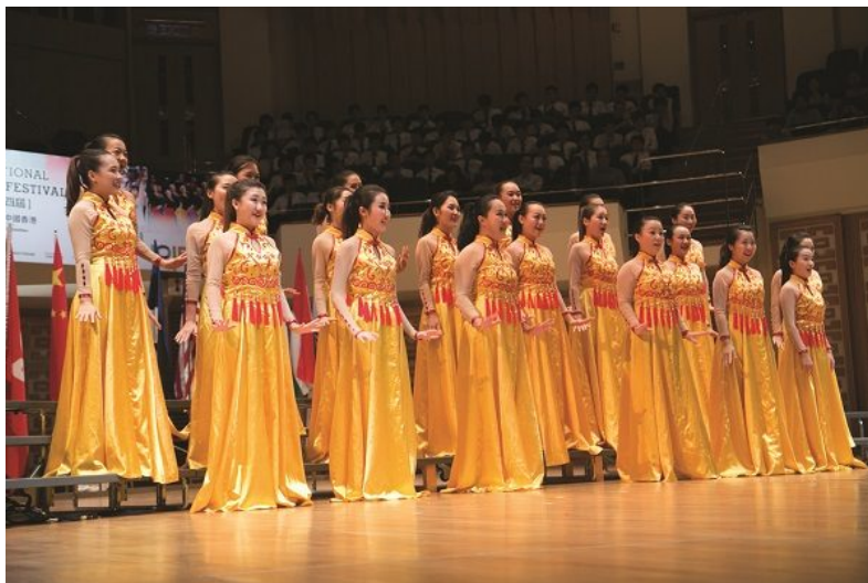
Youth Choir's, SA Voices (age 29 or under): Candlelight Chorus of Shanxi Normal University (China)