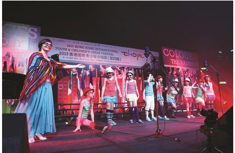
Rassvet (Russia) receives a warm applause for their energetic performance