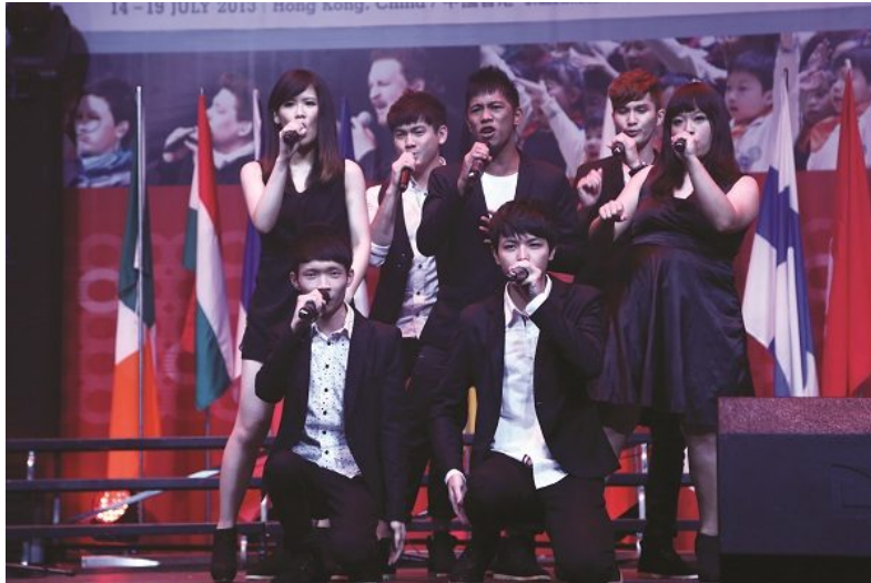
Resident Festival Choir: Just Vocal Band (Chinese, Taipei)

Yunnan Province, China, delivered wonderful performances in the Emperor's Voices and the world-class Choirs Series concerts, leading the audience on an international choral journey. All twelve concerts were held in four concert venues with excellent acoustics.