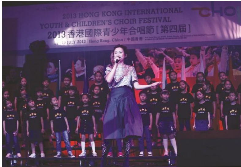
Miss Ivana Wong, a famous pop singer in Hong Kong, singing with the Hong Kong Treble Choir (Hong Kong, China)

Two salute concerts were held, dedicated to the outstanding Hong Kong choirs for their prominent performances in international competitions and their contributions to the development of choral music in Hong Kong. The C.C.C. Kei Wan Primary School Choir, Yuen Long Children's Choir, Marymount Secondary School Choir and Yuen Long District Arts Committee Treble Choir were invited.