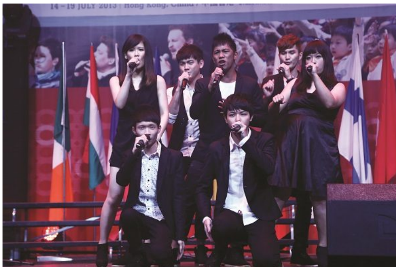
Resident Festival Choir: Just Vocal Band (Chinese, Taipei)

Yunnan Province, China, delivered wonderful performances in the Emperor's Voices and the world-class Choirs Series concerts, leading the audience on an international choral journey. All twelve concerts were held in four concert venues with excellent acoustics.