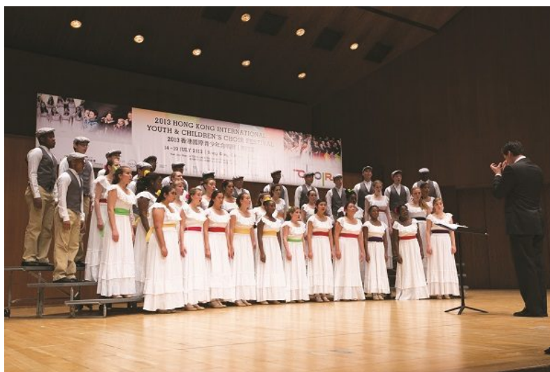
World-class Choirs Series I – Young People's Chorus of New York City Concert (USA)

The Young People's Chorus of New York City (USA) is a multicultural youth chorus, internationally renowned not only for its superb virtuosity and brilliant showmanship but as a model for an inclusive society that is being replicated globally. They received the highest honour for an American youth programme, the "National Arts and Humanities Youth Program Award", presented by First Lady Michelle Obama at the White House in 2011.