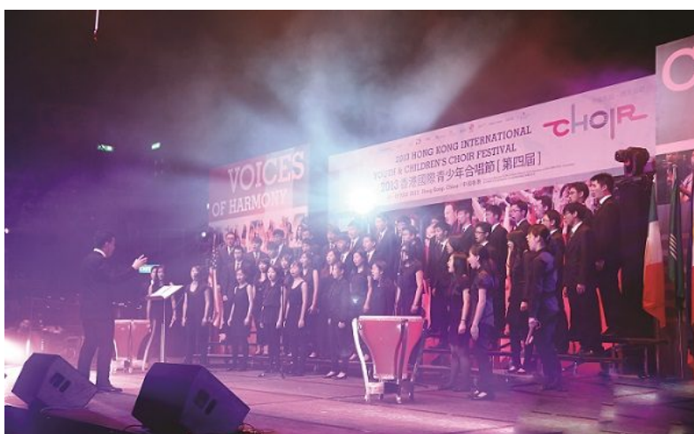
Diocesan Choral Society (Hong Kong,