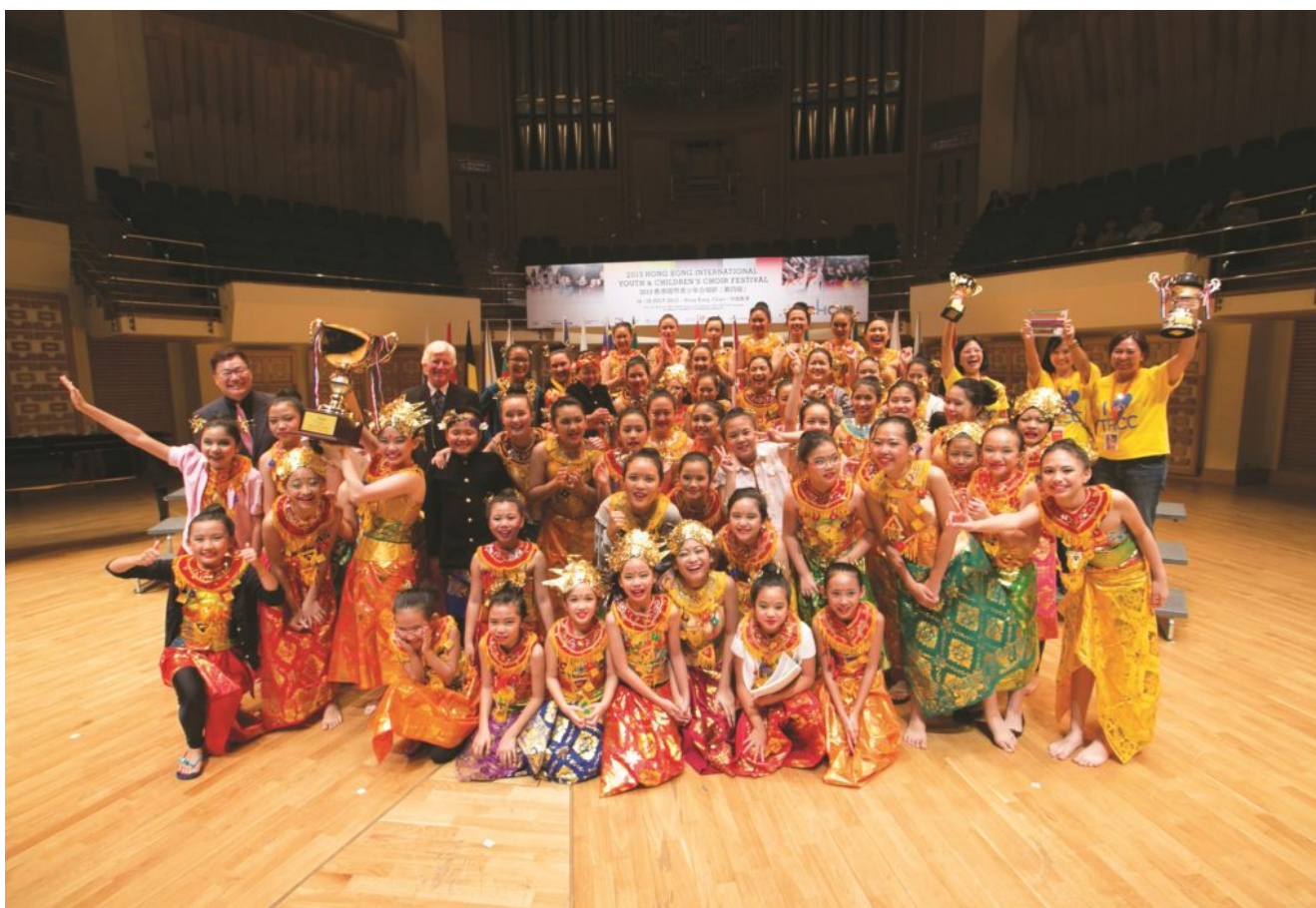
2013 HKIYCCF Choir of the World, Outstanding Conductor Award and Best Stage Effects, Champion of Choirs, SA voices (age 16 or under): The Resonanz Children Choir (Indonesia)

The champions of each category competed for various grand prizes on the Prize Giving & Finalists' Night. The Resonanz Children Choir from Indonesia received warm applause for their spectacular singing skills and stage performance, and were awarded Choir of the World, Outstanding Conductor Award and Best Stage Effects in the 2013 HKIYCCF.