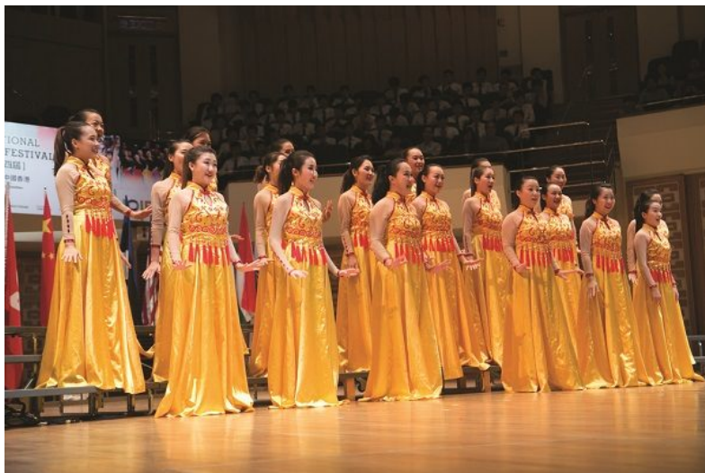
Youth Choir's, SA Voices (age 29 or under): Candlelight Chorus of Shanxi Normal University (China)