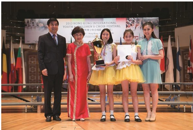
2013 HKIYCCF Jury's Prize: Binhai Primary School Choir – Sound of the Sea (China)