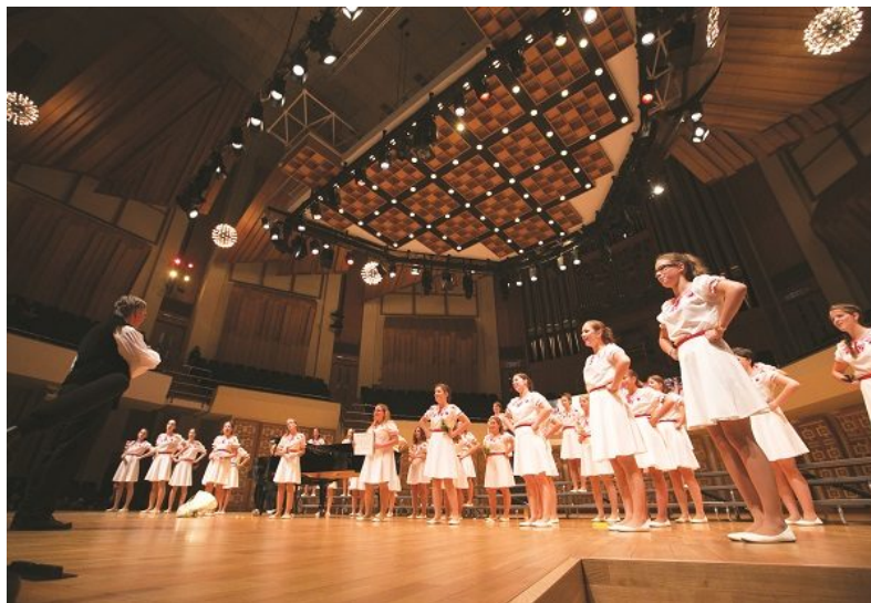
World-class Choirs Series III – Cantemus Children's Choir Concert (Hungary)

The Cantemus Children's Choir (Hungary) is the international prize winning senior pupils' choir of the Kodály Zoltán Primary School in Hungary. Since it was set up, the choir has achieved the highest standard in choral performance and has travelled extensively to give concerts, compete and take part in international festivals throughout Europe and the rest of the world.