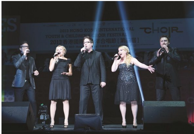
Emperor's Voices – Club For Five Concert I & II (Finland)

The Young People's Chorus of New York City (USA) is a multicultural youth chorus, internationally renowned not only for its superb virtuosity and brilliant showmanship but as a model for an inclusive society that is being replicated globally. They received the highest honour for an American youth programme, the "National Arts and Humanities Youth Program Award", presented by First Lady Michelle Obama at the White House in 2011.