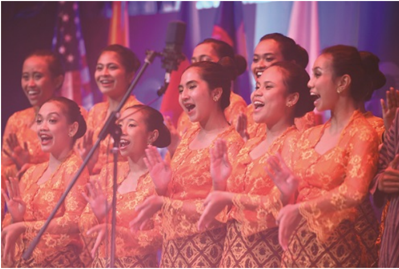
Voca Erudita Student Choirs of Sebelas Maret University (Indonesia) performing in Indonesian traditional costume