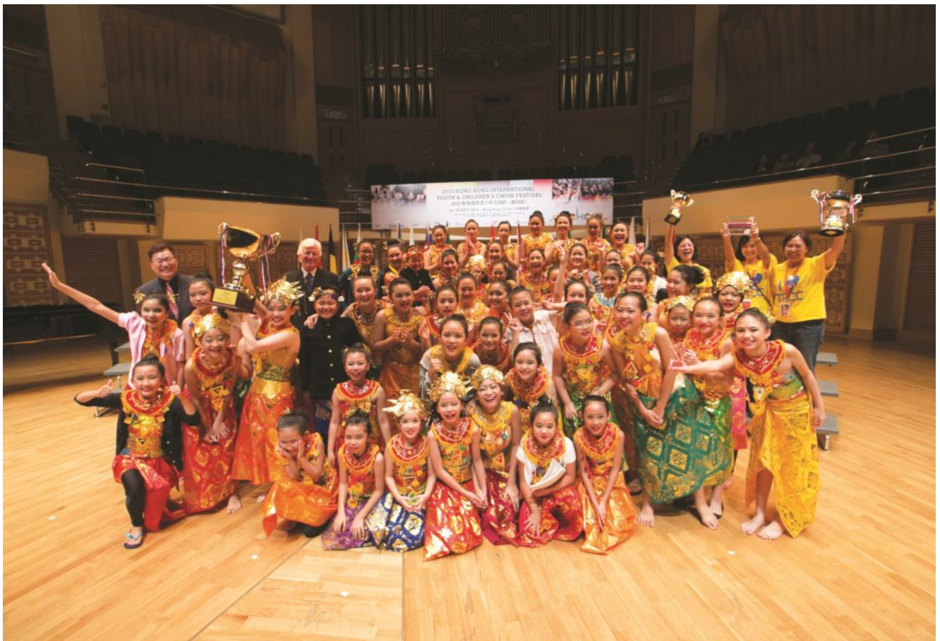
2013 HKIYCCF Choir of the World, Outstanding Conductor Award and Best Stage Effects, Champion of Choirs, SA voices (age 16 or under): The Resonanz Children Choir (Indonesia)

The champions of each category competed for various grand prizes on the Prize Giving & Finalists' Night. The Resonanz Children Choir from Indonesia received warm applause for their spectacular singing skills and stage performance, and were awarded Choir of the World, Outstanding Conductor Award and Best Stage Effects in the 2013 HKIYCCF.