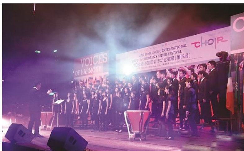
Diocesan Choral Society (Hong Kong,