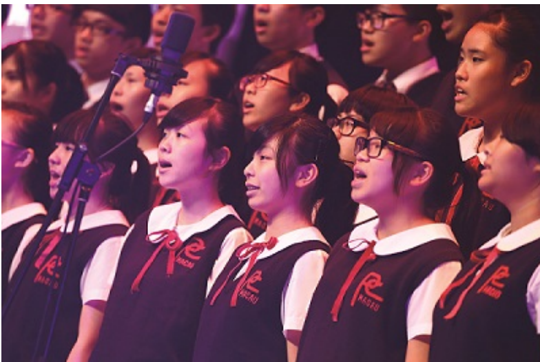
Pui Ching Middle School Choir (Macau, China) presents The Macau Song in the Opening Concert

The choirs from China, Chinese Taipei, Finland, Hungary, Indonesia, Macau, Malaysia, Russia and the USA gathered in Hong Kong to join this international choral fiesta. The theme of the festival this year was 'Voices of Harmony, Colour the Rainbow'. The rainbow symbolises hope; the idea of colouring the rainbow represents our growing hope and keeping our dream shining on the stage. The different colours of the rainbow promote the spirit of mutual tolerance and respect among people regardless of nationality and race. Music, as a common language across the world, brings happiness and harmony to everyone while reflecting the uniqueness of the individual.