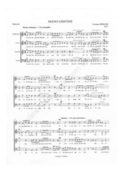
Mano Gimtiné -Image 1