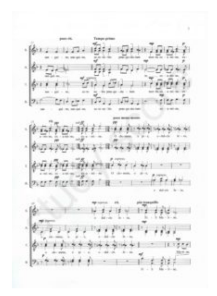
Ave Verum Corpus — Image 2