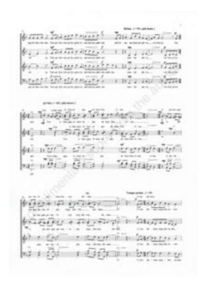
Mano Gimtiné — Image 2