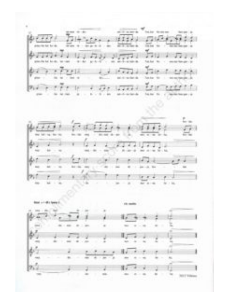
Mano Gimtiné -Image 3

http://icb.ifcm.net/wp-content/uploads/2013/04/ComposersCorner _Miskinis_interview_mano_gimtine_pronunciation.mp3