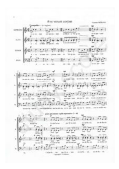
Ave Verum Corpus — Image 1