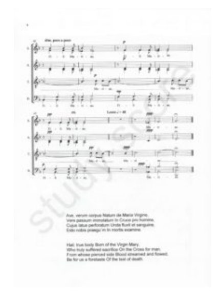
Ave Verum Corpus — Image 3