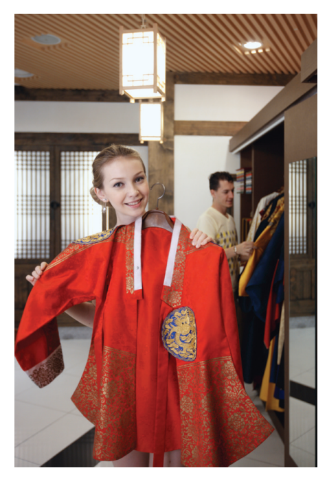
Hanbok Traditional Costume