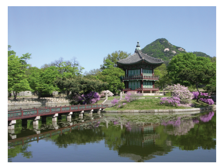
HyangWonJeong in Gyeongbokgung

Joseon Dynasty including Changdeokgung Palace, a UNESCO World Heritage site, are found in this area. Near these palaces are old Hanok villages, composed of traditional housing, which will take you back to the past. The Korea House and Samcheonggak are also excellent places that must be visited to truly experience traditional Korean culture and ways of life.