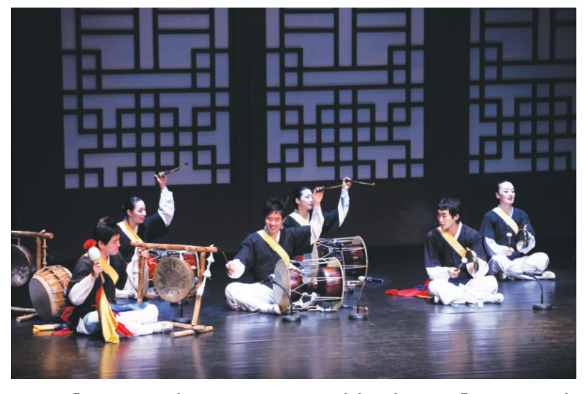
Samul nori, a traditional music originating in Korea, is performed with four percussion instruments

U NESCO World Heritage: Sites Valuable Korean cultural heritage: Because of their unique aesthetic beauty, Changdeokgung Palace and Jongmyo Shrine have been designated as World Cultural Heritage sites.