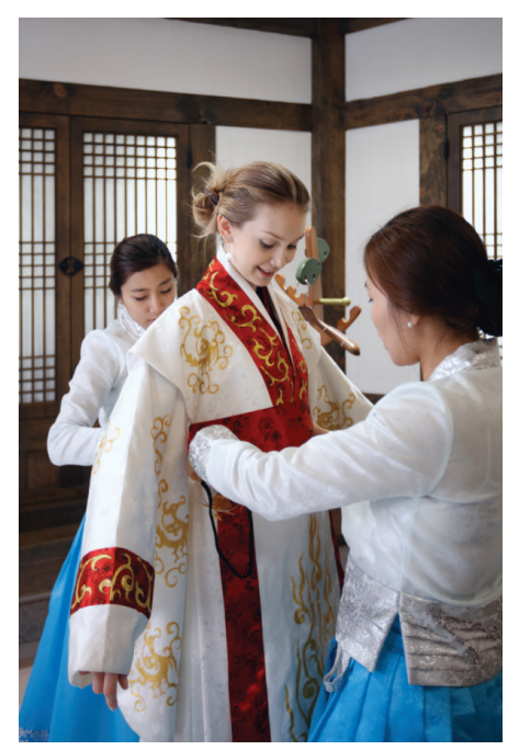
Hanbok Traditional Costume

Where to look for rare books or popular reading material in