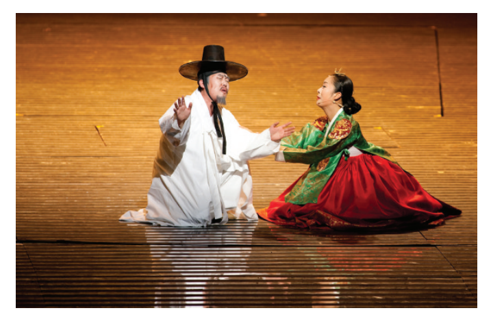
The National Theater of Korea by KOREA.NET