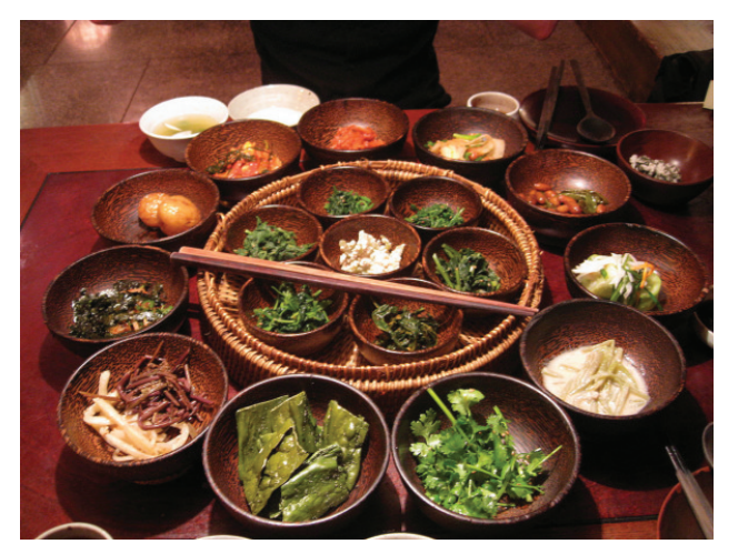
Insadong Sanchon

Where to experience the trendy culture of Seoul